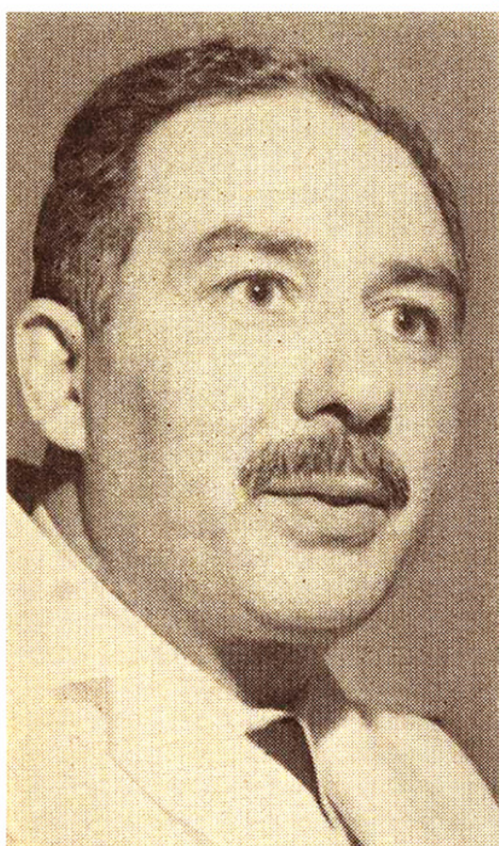
DR. SIDNEY FARBER