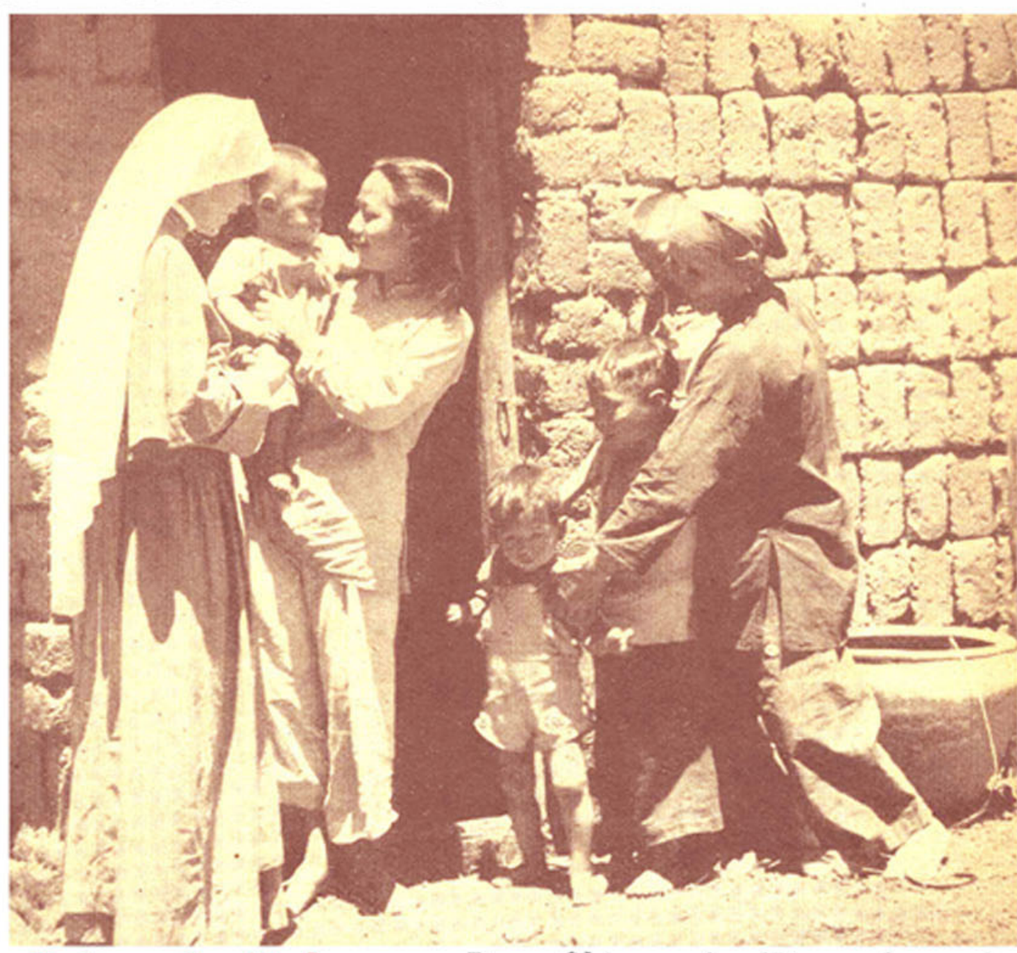
Before the Reds came. Poor Chinese families welcomed the ministering nuns.