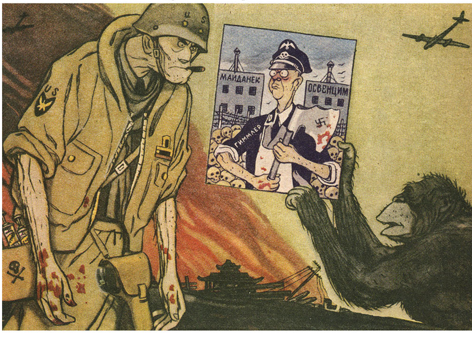
"Corrections to Darwin." The ape holds a picture of Gestapo chief Himmler and Nazi concentration camps. He tells the U.S. soldier: "No, it's not from me you descend, Mister, it's from him."

Line of Lies. Since then the Kremlin—echoed by Reds everywhere—has accused the U.S. of torture, rape and germ warfare. Americans, the Reds claim, have led war prisoners by rings through their noses. U.S. soldiers, they charge, stuffed a woman's hair into her mouth and pulled it out through a hole they had cut in her throat.