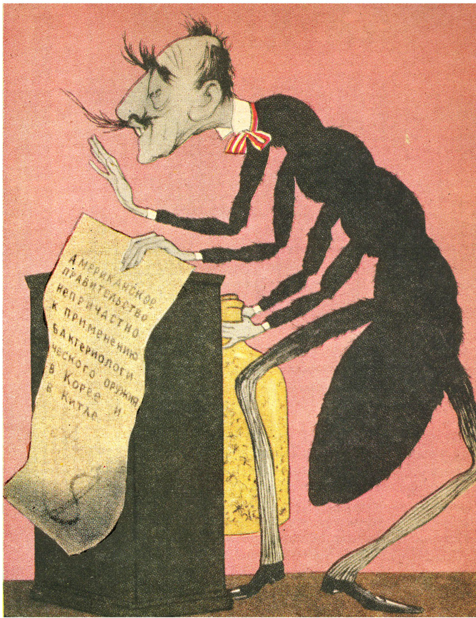
Spidery Secretary of State. Dean Acheson's placard explains that "The U.S. Government has no part in the application of bacteriological weapons in Korea and China."