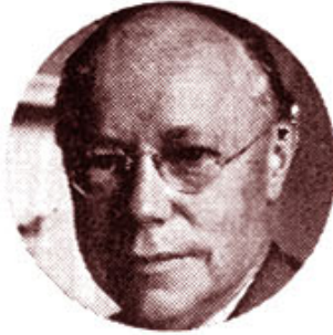
R. A. TAFT