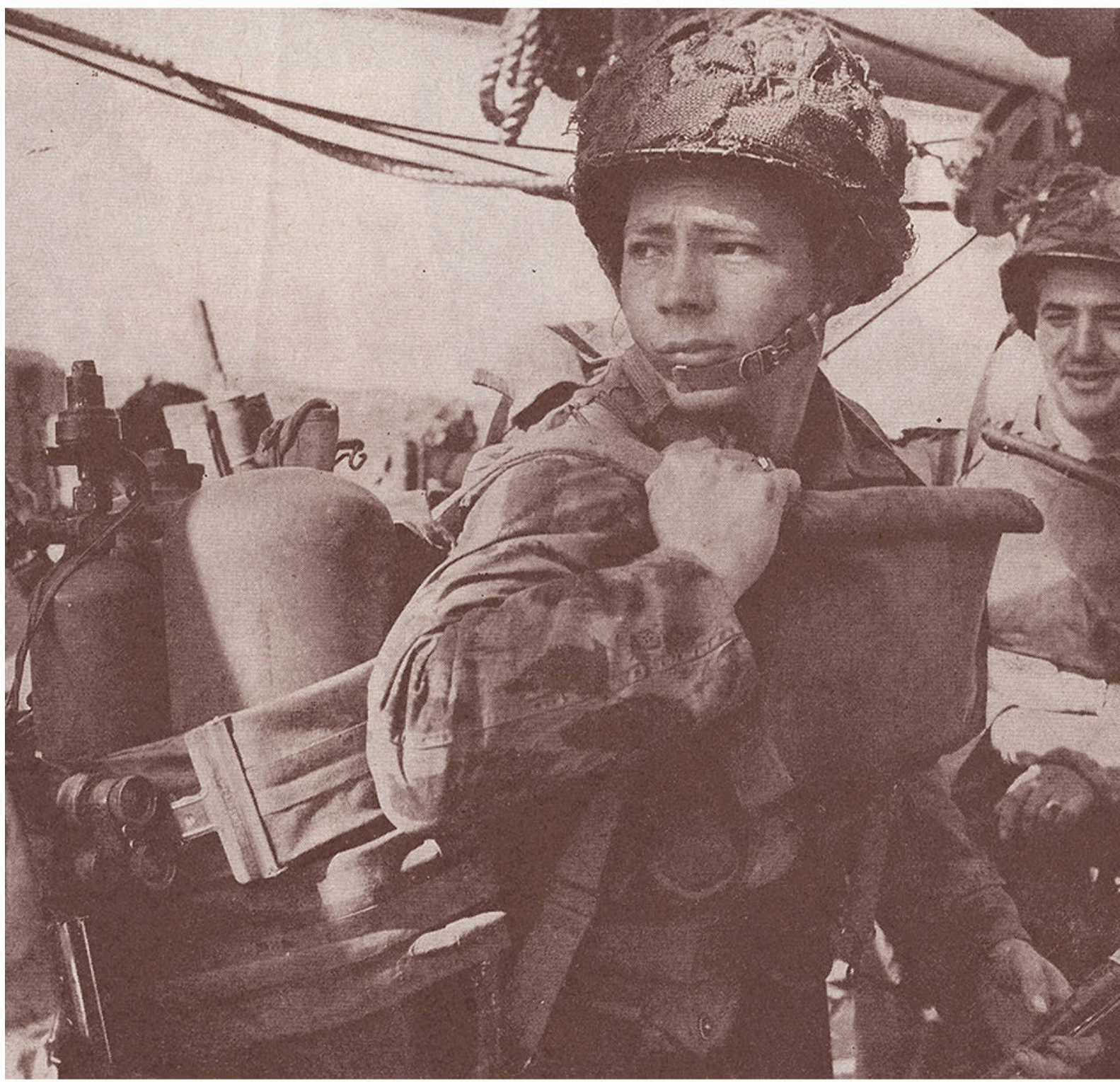
A young engineer, packing the Army's new, deadly flame thrower, makes ready to hit the beaches of Normandy