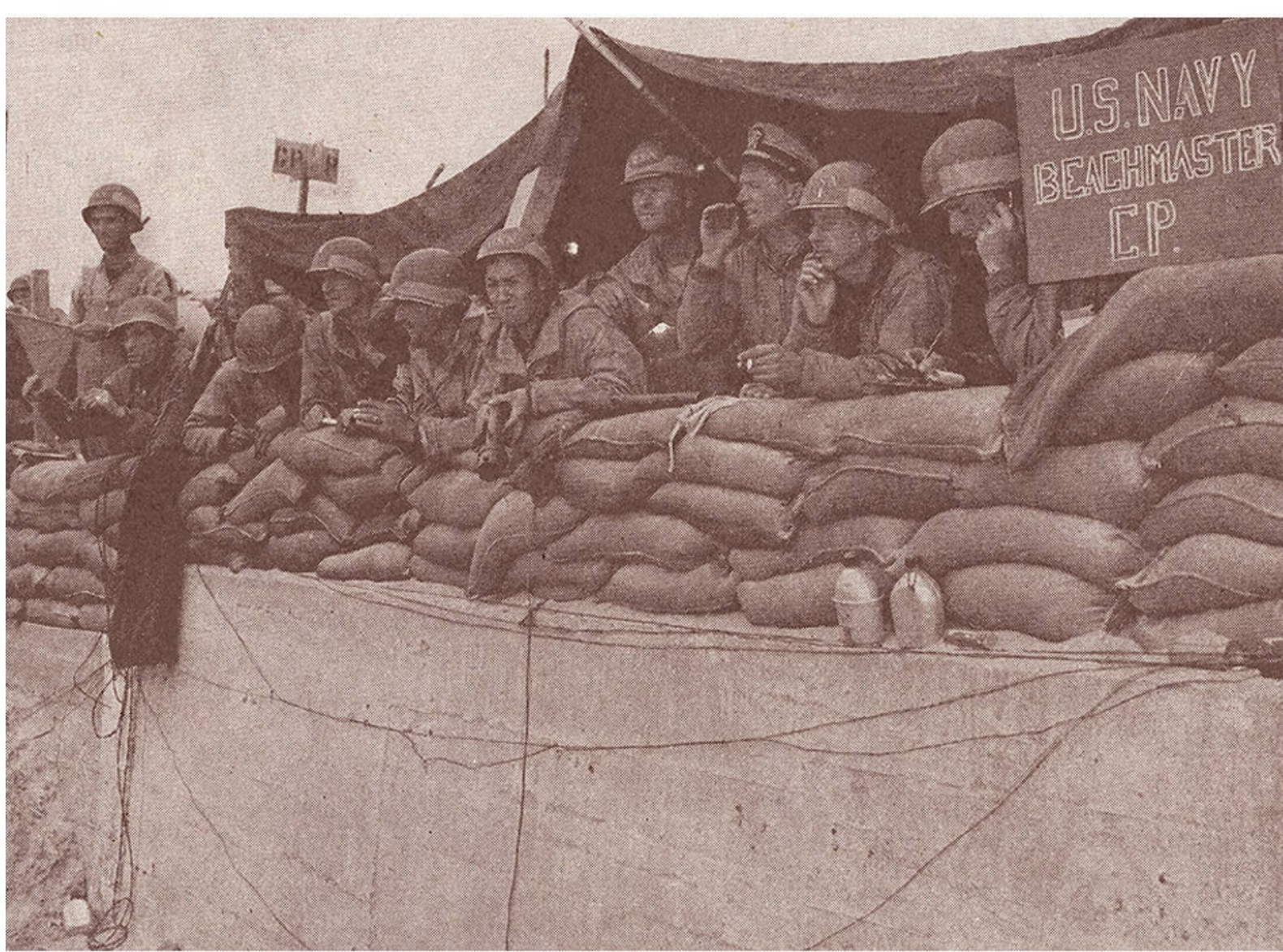
Navy Beachmaster Command Post, above, issued all orders to ships lying offshore on what to send in next

A desperate period of crisis when American courage turned a Normandy beachhead into a European invasion front is described by Collier's war correspondent