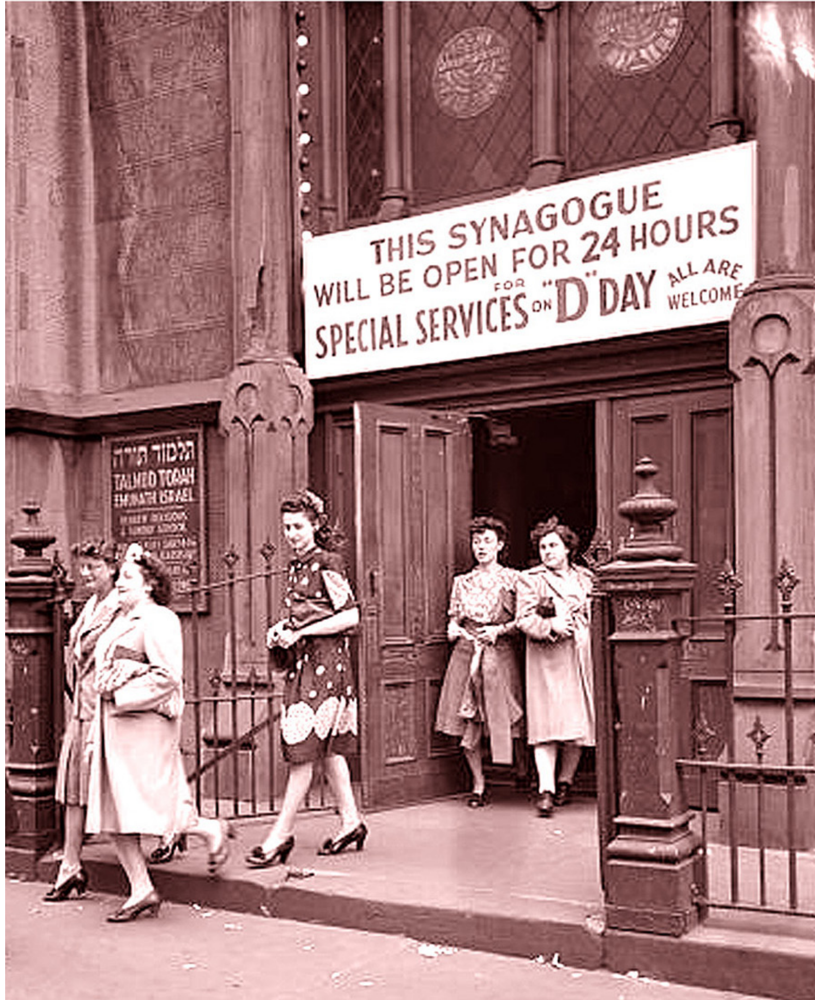
D-Day Synagogue Services, June 6, 1944

On the evening of D Day, President Roosevelt led a radio audience estimated at 100,000,000 in a prayer of his own composing: "Our sons, pride of our nation, this day have set upon a mighty endeavor . . . Lead them straight and true . . . Their road will be long and hard . . . Some will never return. Embrace these, Father, and receive them."