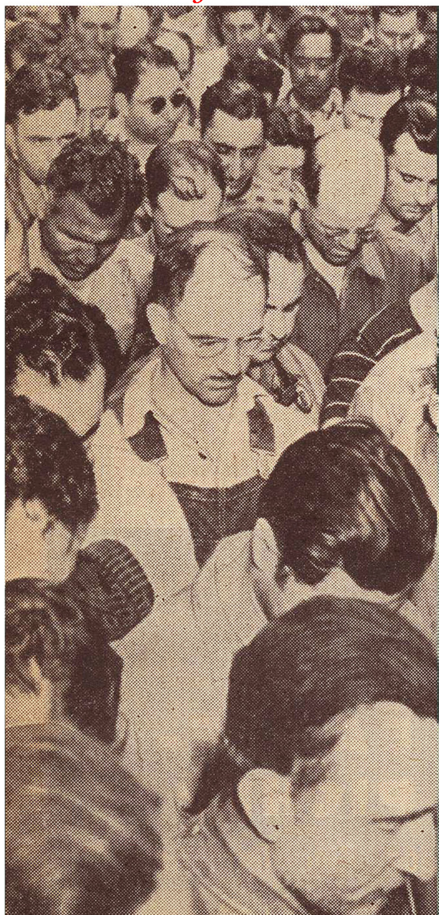
Workmen pray in a New Jersey shipyard

By the dawn's early light America awoke to the knowledge that its D Day had come. Electricity meters clocked a sudden spurt in kilowatt loads as house lights and radios went on; telephone switchboards jammed as excited householders passed the word along. By morning on June 6, scarcely a family failed to know that the nation's sons and brothers, husbands and sweethearts were even then storming the beaches of Normandy to begin the Allied liberation of Europe.