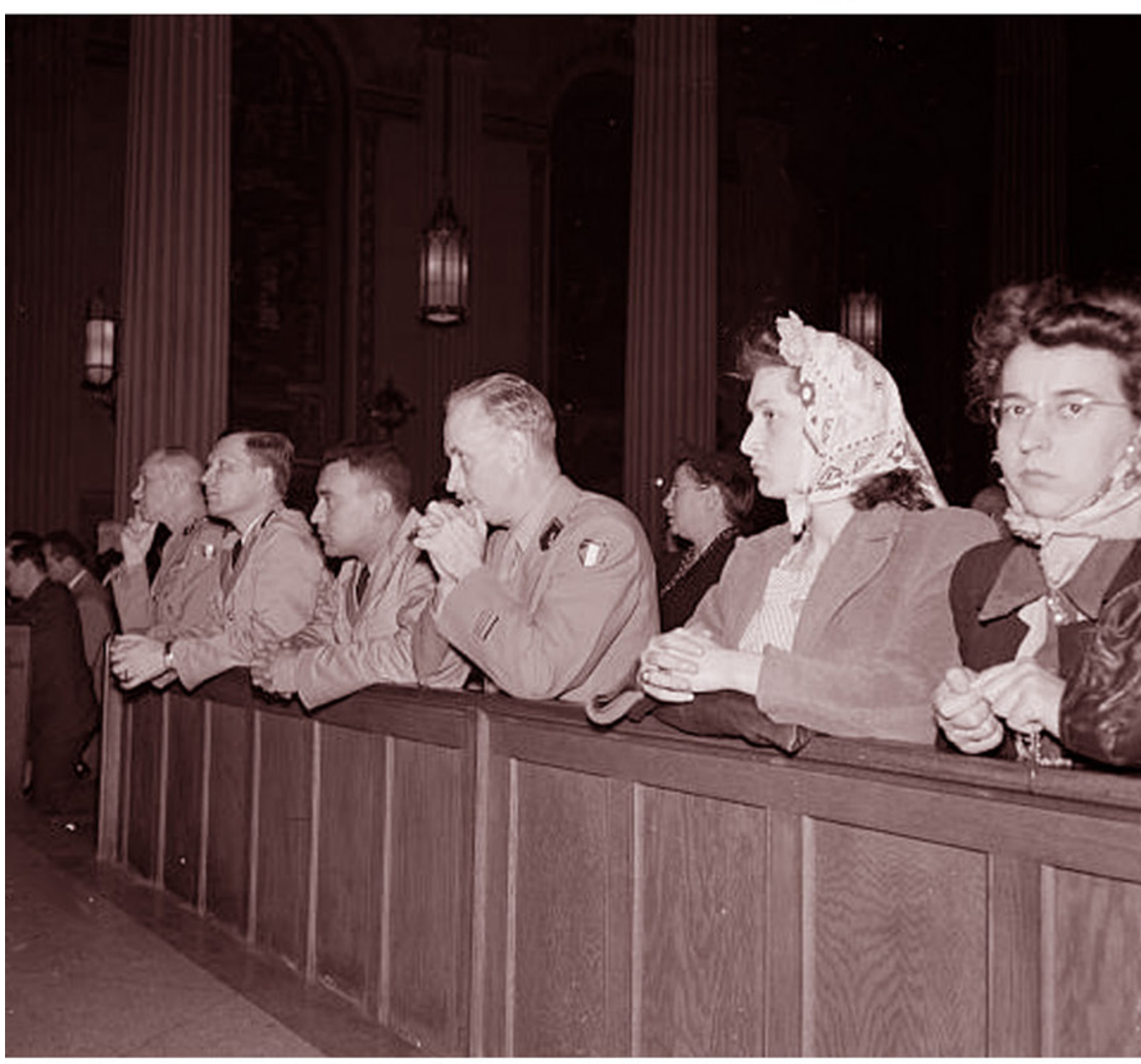
D-Day services at Saint Vincent De Paul Church. New York City

Subdued Home Front Sees Invasion as Hazardous Launching, Not as Celebration Signal