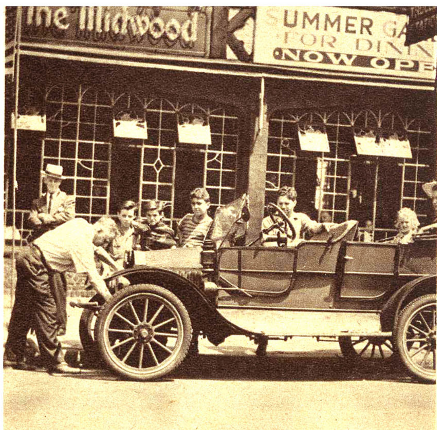
Curious crowds always gather around the antiquated auto, amazed that it still can navigate.