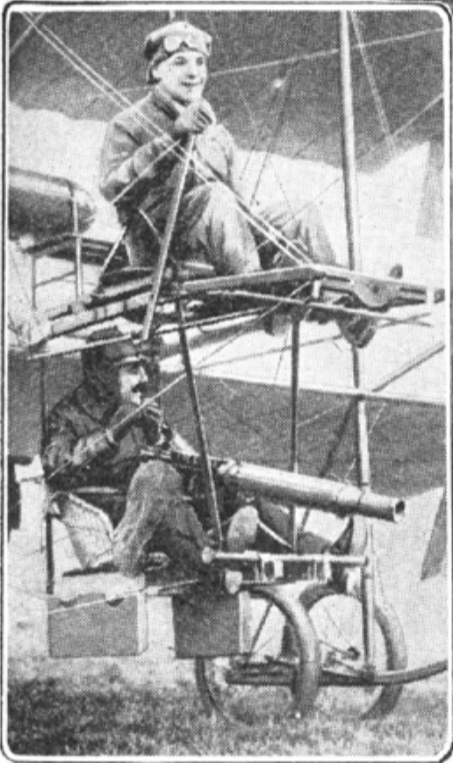
Double-Deck Armed Flying Machine of English Forces

operation radius of about 300 miles, and when carrying its crew, 300 rounds of ammunition, and with its oil and fuel tanks filled, it weighs 1,760 lb. It uses a