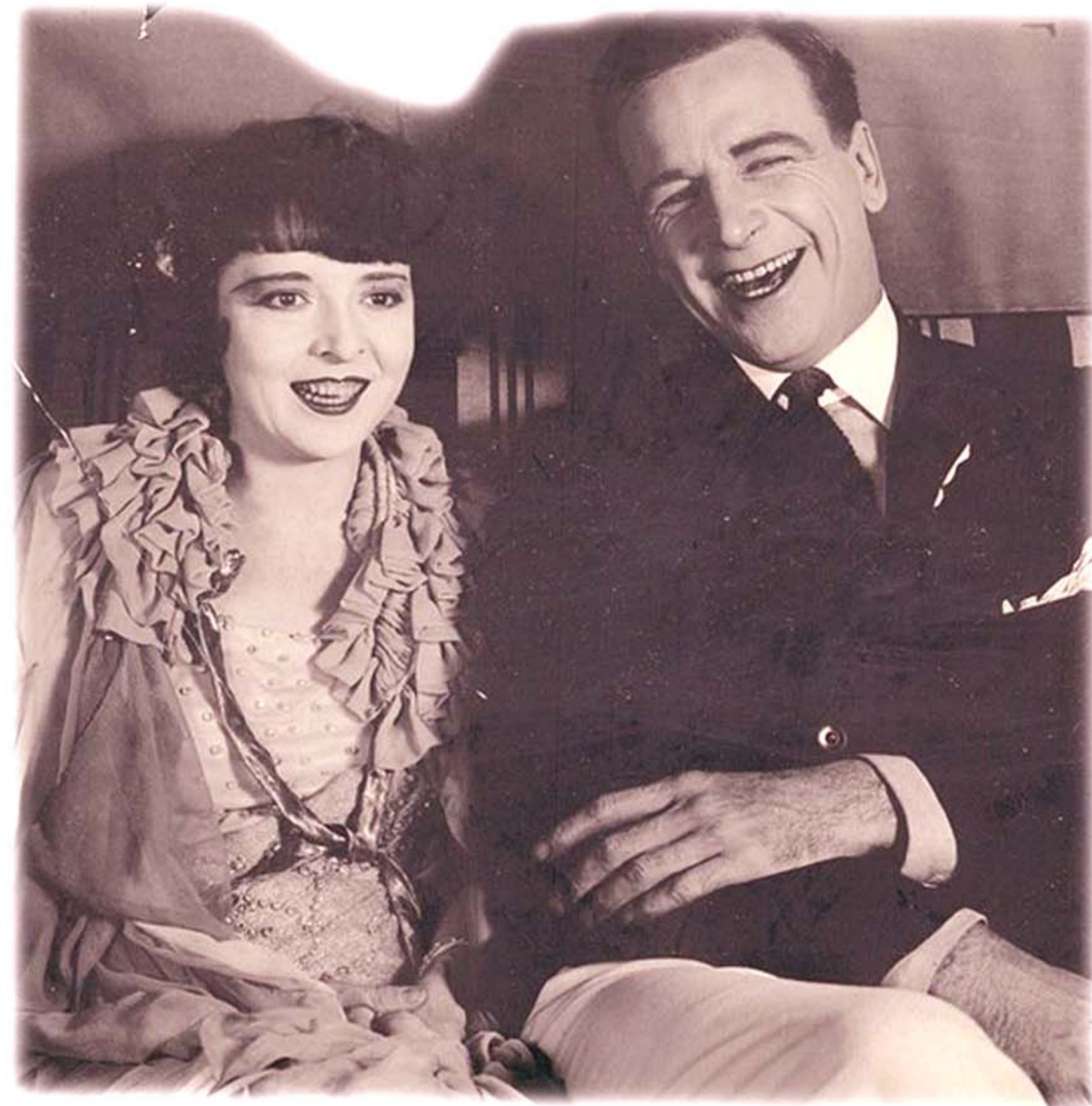
Colleen Moore and Milton Sills as seen in Flaming Youth (1923)

Flaming Youth endeavors to establish that young men and maidens wild are going up in the smoke of their own cigarettes. It contains all the rabble of trashy devices which cinema directors employ traditionally to indicate the younger degeneration, even to the midnight bathing party. All this is unfortunate, since the story of the socially rabid mother who on her deathbed persuaded her physician to write her spirit letters of her daughter's progress, is rather ingenious. She gave the girl the combination of the safe where the letters were to be left, hoping that the reports and reflections therein would fortify her philosophy against a jazz-mad world. Milton Sills and Colleen Moore make much of the leading rôles.