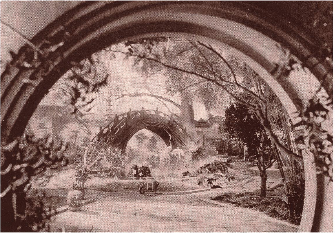
Set Designed by Cedric Gibbons for the Metro-Goldwyn-Mayer Screen Production, "Private Lives"