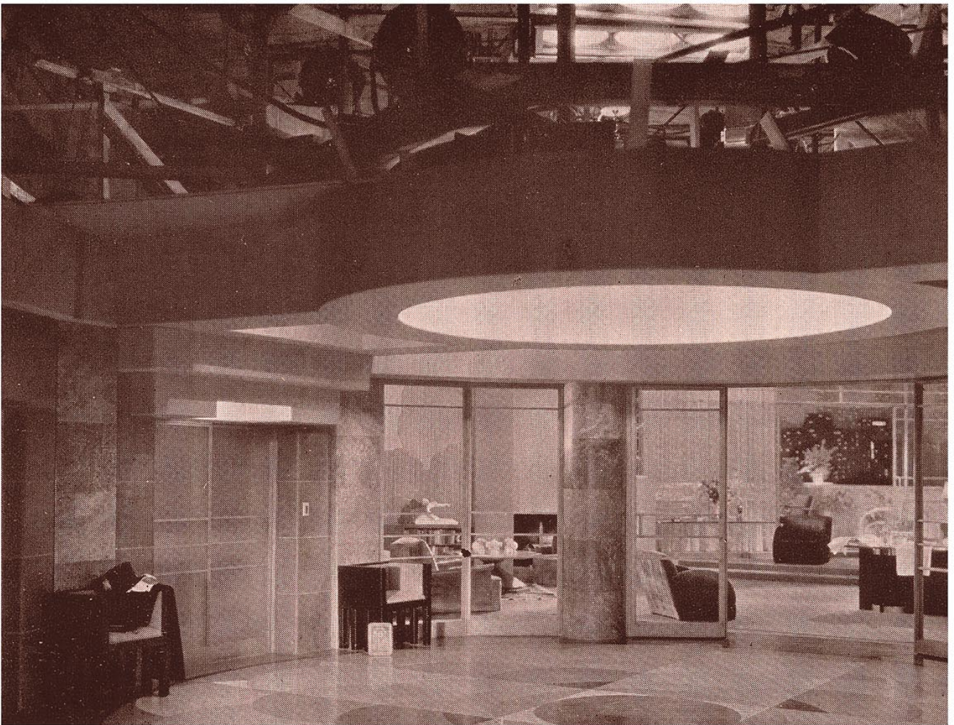
Set Designed by Cedric Gibbons for the Metro-Goldwyn-Mayer Production, "The Fall and Rise of Susan Lenox"