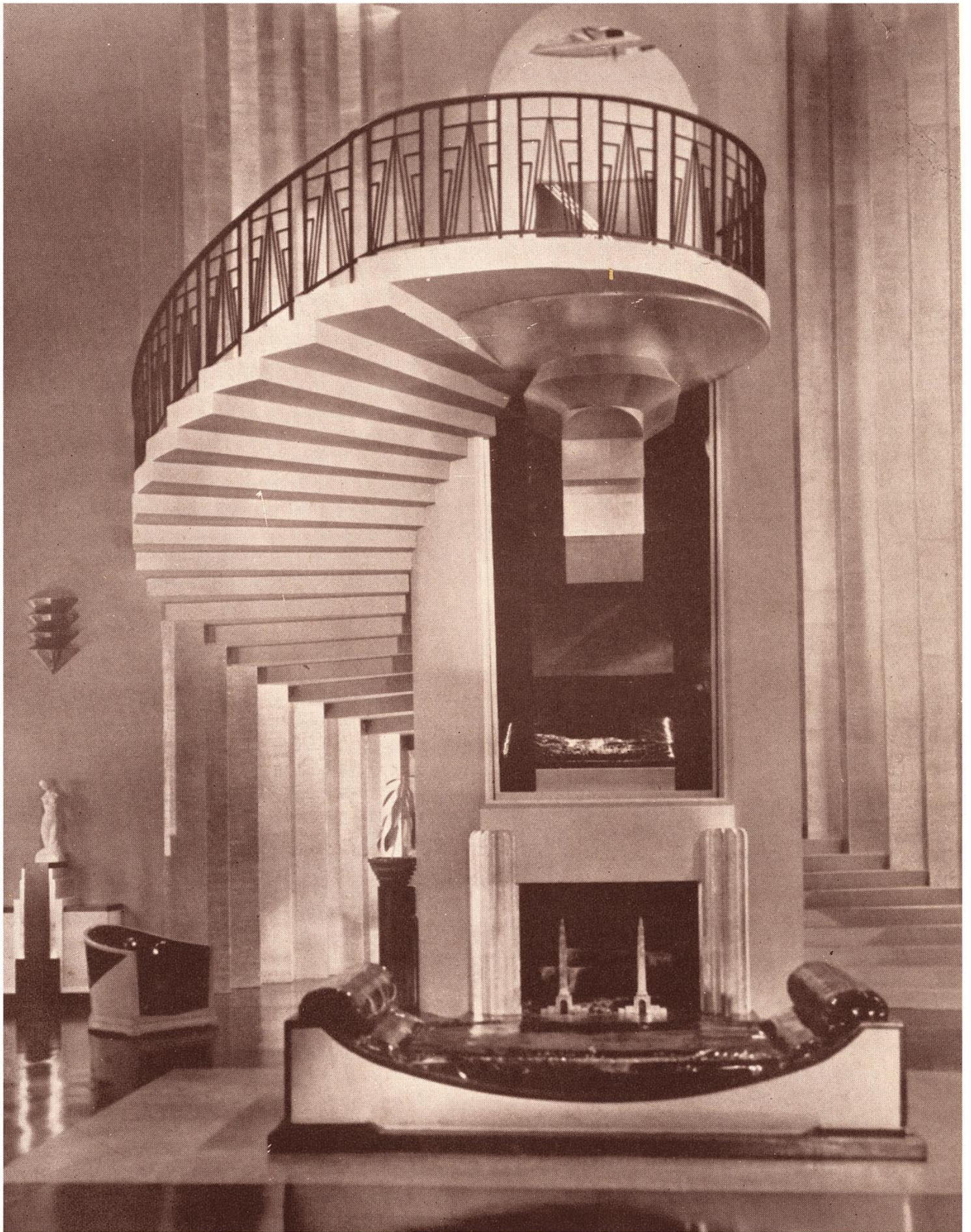
Set Designed by Cedric Gibbons for a Metro-Goldwyn-Mayer Production