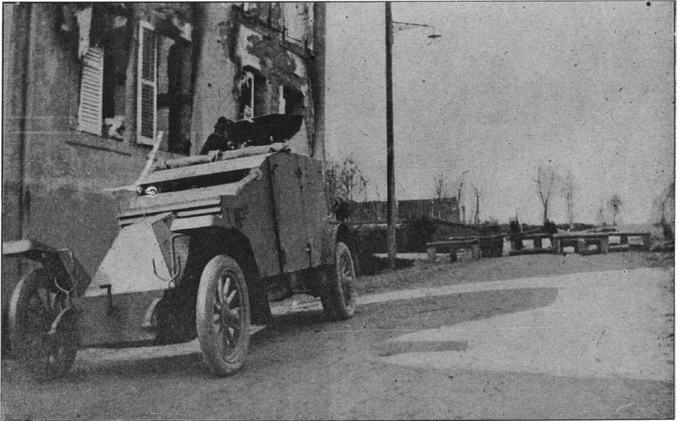
This armored car, thanks to it's extreme mobility and power, gives tremendous aid to our Marines who are serving on the Northern plains and in Belgium.