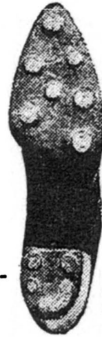
Plugged sole of Scotch oxford golf shoe, for firm stance

A LTHOUGH it has nothing to do with riding, I have illustrated in this issue, an excellent type of shoe for golf. This is a Scotch oxford with a Lorne tongue and a scarfe sole set with plugs, of course, which give a very firm grip on the ground. It is vitally important to have a firm stance and to this the shoe — properly designed — contributes very greatly. A rather interesting high golf shoe now on the market, which I shall illustrate in a later issue, incorporates a special feature at the instep which permits the player to turn very freely without moving his foot. This is a feature which will be appreciated by those who like to wear golf shoes of ankle height but who dislike the stiffness at the ankle which is frequently found in them. Perfect freedom of movement during the course of the swing contributes much to the success of one's game.