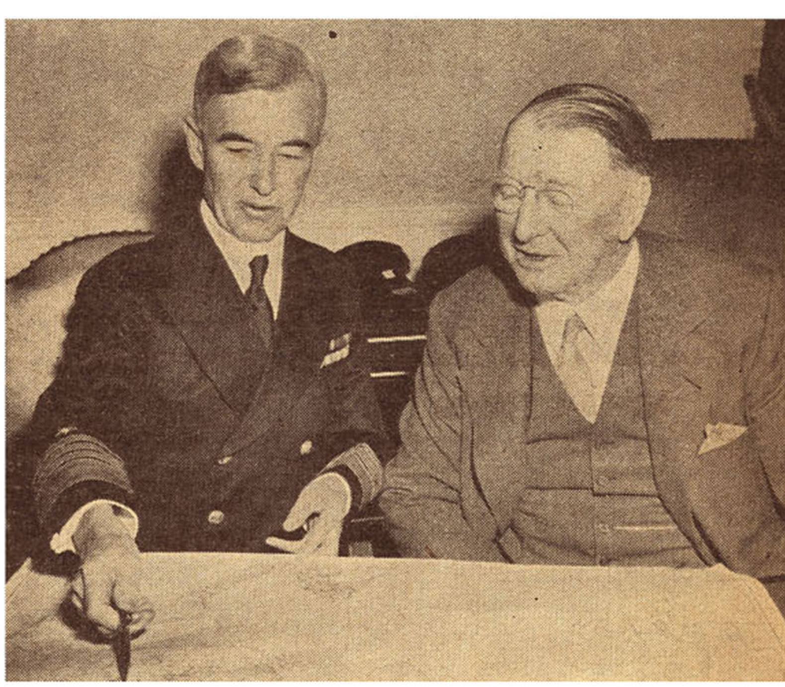
ADMIRAL HART AND THE LATE SECRETARY KNOX

Admiral Richardson testified last November that he tried to persuade the President to return the Fleet to the West Coast, because preparation for possible war could be carried on better there. By 1941, however, top men in the Navy accepted it as settled that the Fleet was to stay in Hawaii as long as the situation remained critical, and in recent days Admirals Stark, Wilkinson and Turner all told the Committee they considered the Fleet, at Pearl Harbor, was where it should have been.