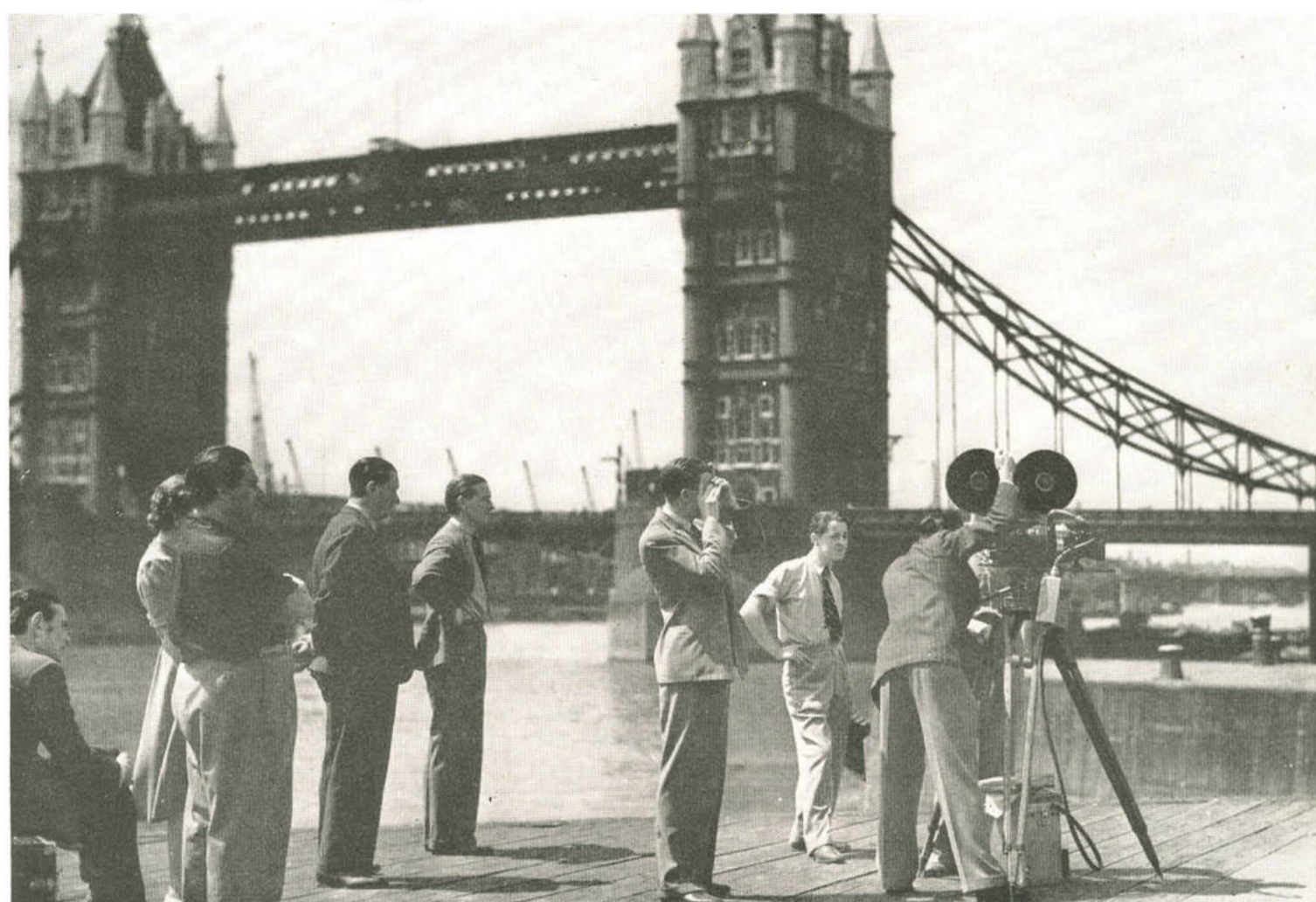
B y London's famous Tower Bridge, Gabriel Pascal (standing at left) shoots a scene of Major Barbara , starring Wendy Hiller and Robert Morley, while the sky is still clear of bombers. This area, around the Thames docks, got the worst bombing of any part of London.

T HE British may have tea during air-raids and dress for dinner in bomb shelters, but for sheer British composure we give you Mr. Gabriel Pascal, who is calmly making a movie at Denham outside London. Mr. Pascal, a Briton out of Budapest, is the producer who, by virtue of making Pygmalion , enjoys a monopoly of the film rights to Shaw's plays. He started shooting last August on Shaw's Major Barbara and, come bombs or parachutists, he intends to finish it. These pictures, exclusive to STAGE, show some of his problems and the following notes, from a diary kept by a member of the cast, tell others: