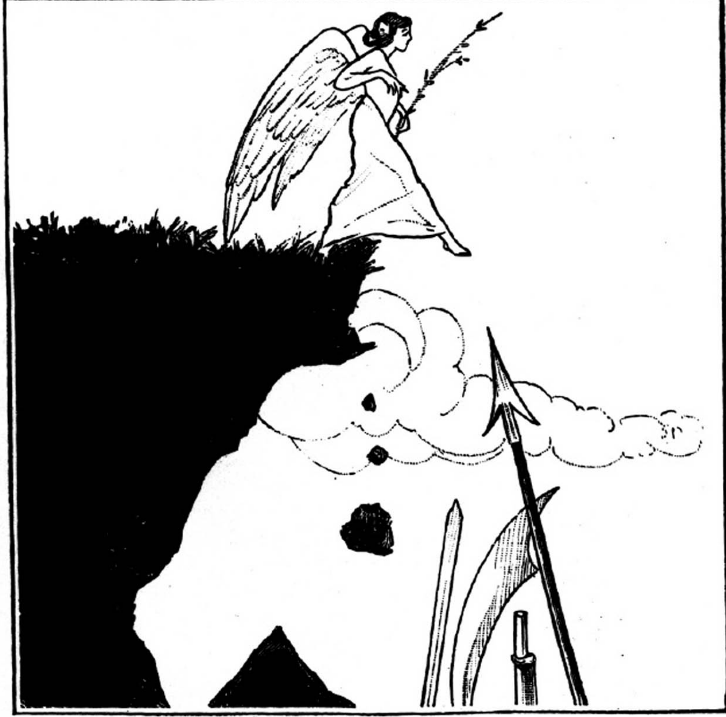
THE PROGRESS OF PEACE.

A VERY INFLUENTIAL military writer of Germany declares that Germany must win her place as a world power through warfare. This is General Bernhardt, who in his new volume on " Deutschland und der Naechste Krieg " ("Germany and the Next War") practically throws down the gauntlet to Europe, and to England in particular. Never has the policy of Berlin been proclaimed so clearly and so fearlessly. The General's book gives a candid expression of the view that his country must fight its way to predominance regardless of the rights and interests of other people. This accepted authority on current strategical and tactical problems describes the peace movement as simply "poisonous." In one chapter he discusses