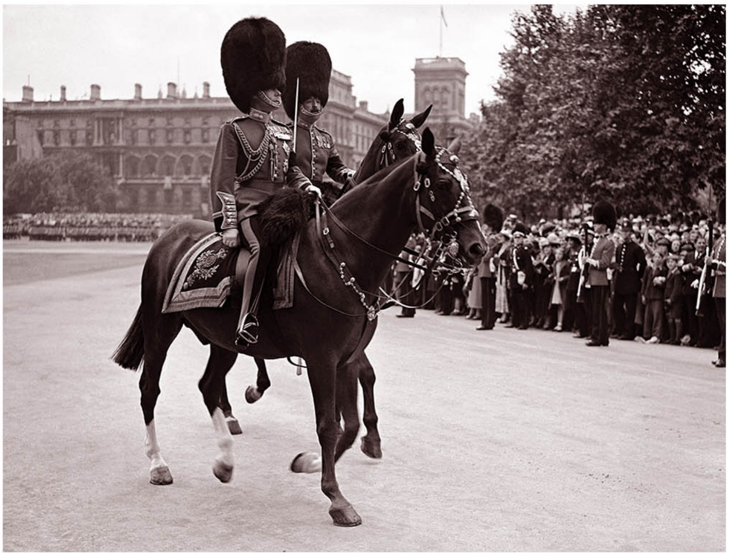
The Prince at the ceremony of Trooping the Color

cares and worries, he still has that happy, boyish smile.