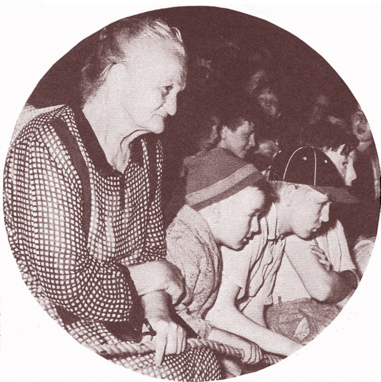
TWO MILLION enjoyed WPA open-air shows last year