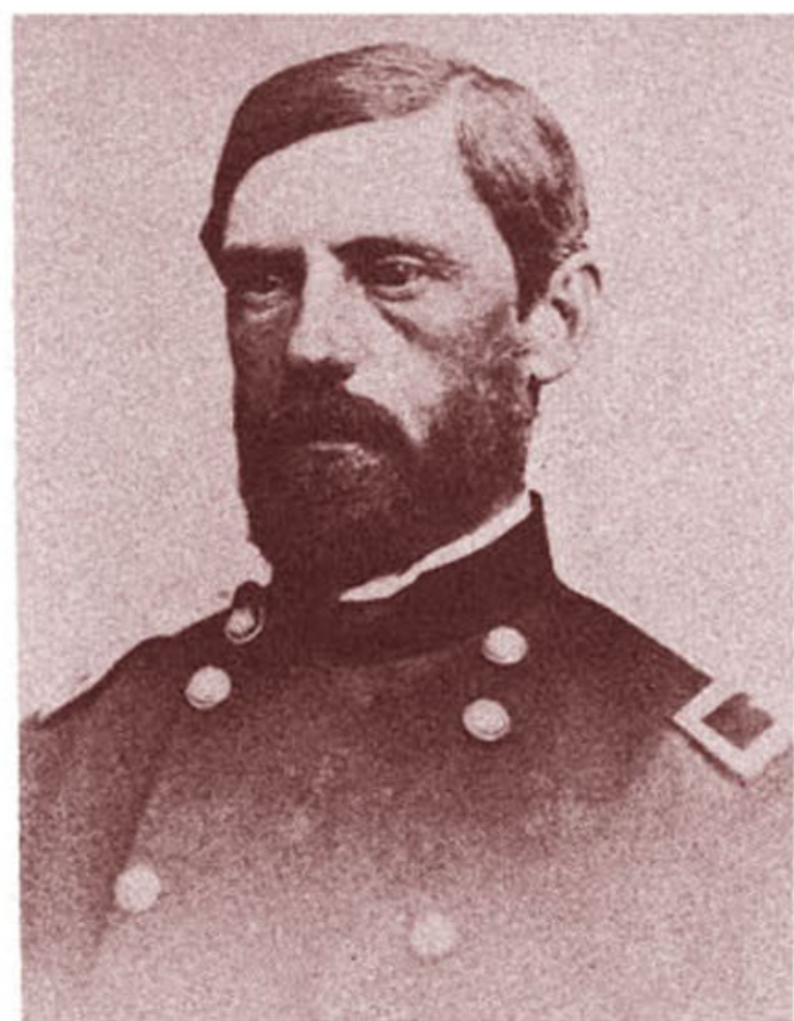
Maj. Gen. John F. Reynolds.

In the intervening 2 days since he had assumed command of the Union forces, General Meade had moved his troops northward and instructed his engineers to survey a defensive battle position at Pipe Creek, near Taneytown, in northern Maryland. Buford's cavalry, which had effectively shadowed Lee's advance from the mountaintops of the Blue Ridge, was ordered to make a reconnaissance in the Gettysburg area. It was