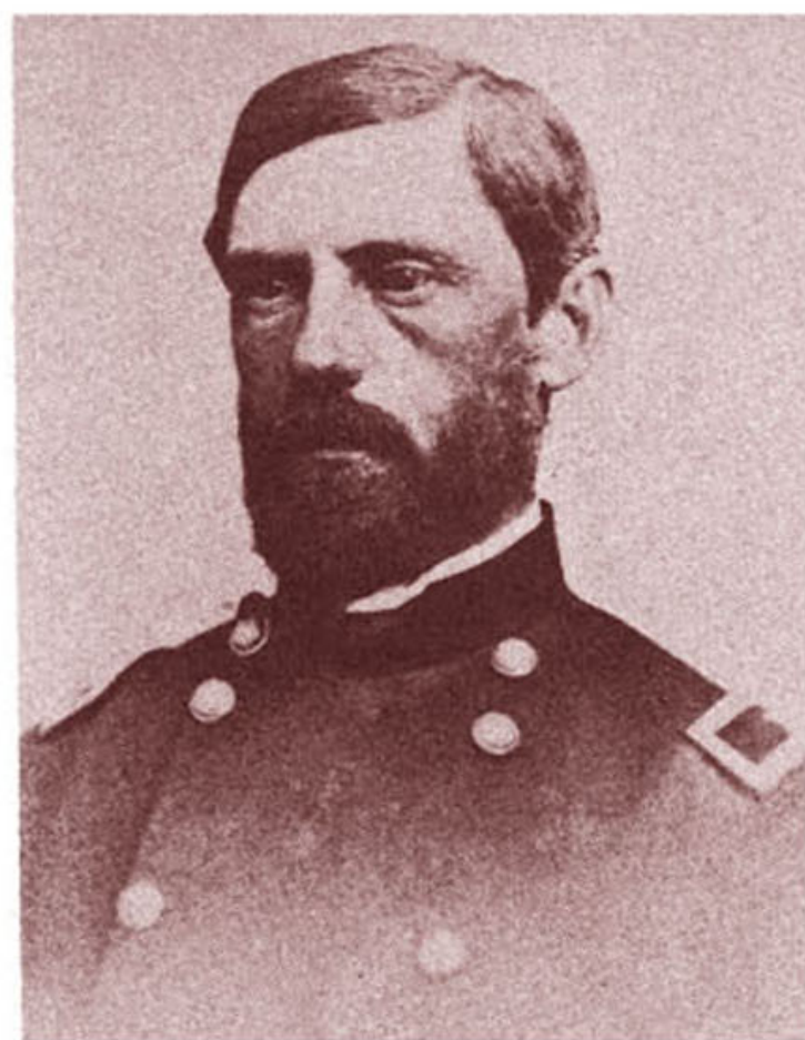
Maj. Gen. John F. Reynolds.

In the intervening 2 days since he had assumed command of the Union forces, General Meade had moved his troops northward and instructed his engineers to survey a defensive battle position at Pipe Creek, near Taneytown, in northern Maryland. Buford's cavalry, which had effectively shadowed Lee's advance from the mountaintops of the Blue Ridge, was ordered to make a reconnaissance in the Gettysburg area. It was