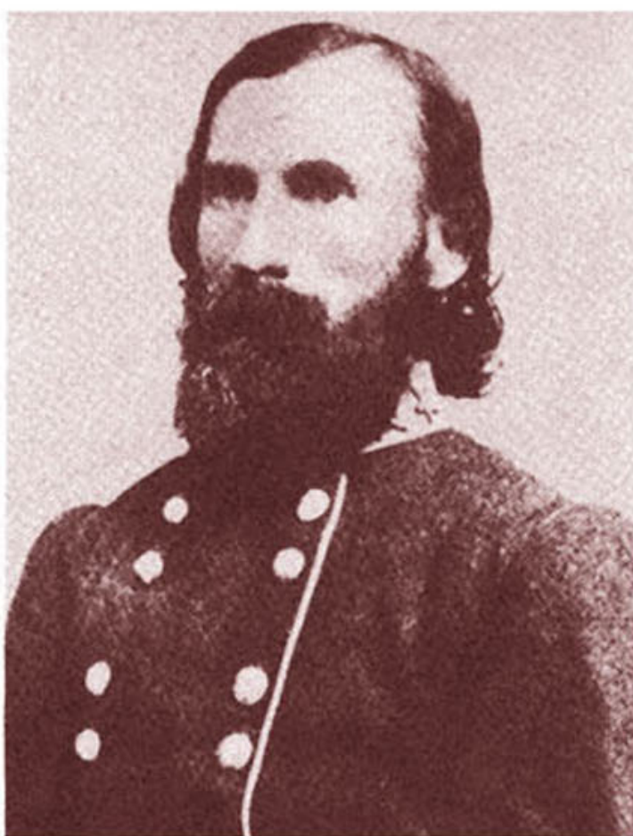
Lt. Gen. Ambrose P. Hill.

these troops that Pettigrew's men saw posted on the roads leading into the town. Neither Lee nor Meade yet foresaw Gettysburg as a field of battle. Each expected to take a strong defensive position and force his adversary to attack.