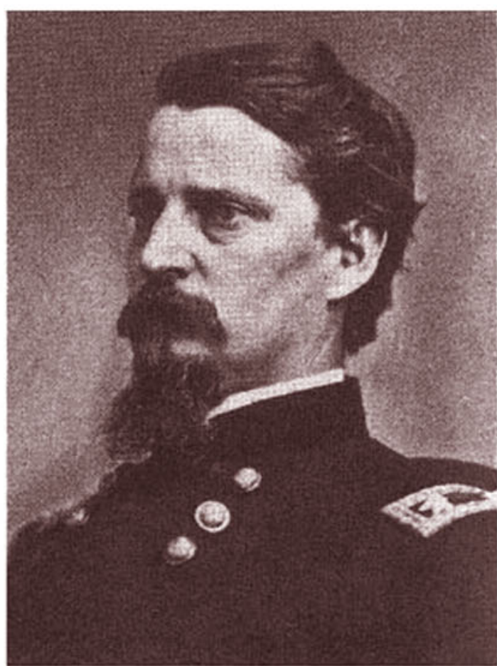
Maj. Gen. Winfield S. Hancock.

Ewell was now in possession of the town, and he extended his line from the streets eastward to Rock Creek. Studiously observing the hills in his front, he came within range of a Union sharpshooter, for suddenly he heard the thud of a minie ball. Calmly riding on, he remarked to General Gordon at his side, "You see how much better fixed for a fight I am than you are. It don't hurt at all to be shot in a wooden leg."