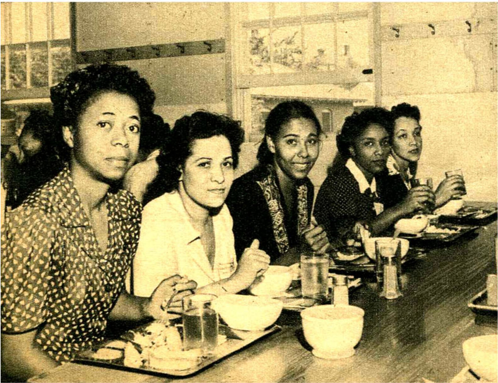
Five members of the colored regiment eat one of their first meals in the mess. According to WAAC Director Oveta Culp Hobby, they will eventually be assigned to Negro regiments at Fort Huachuca in Arizona.