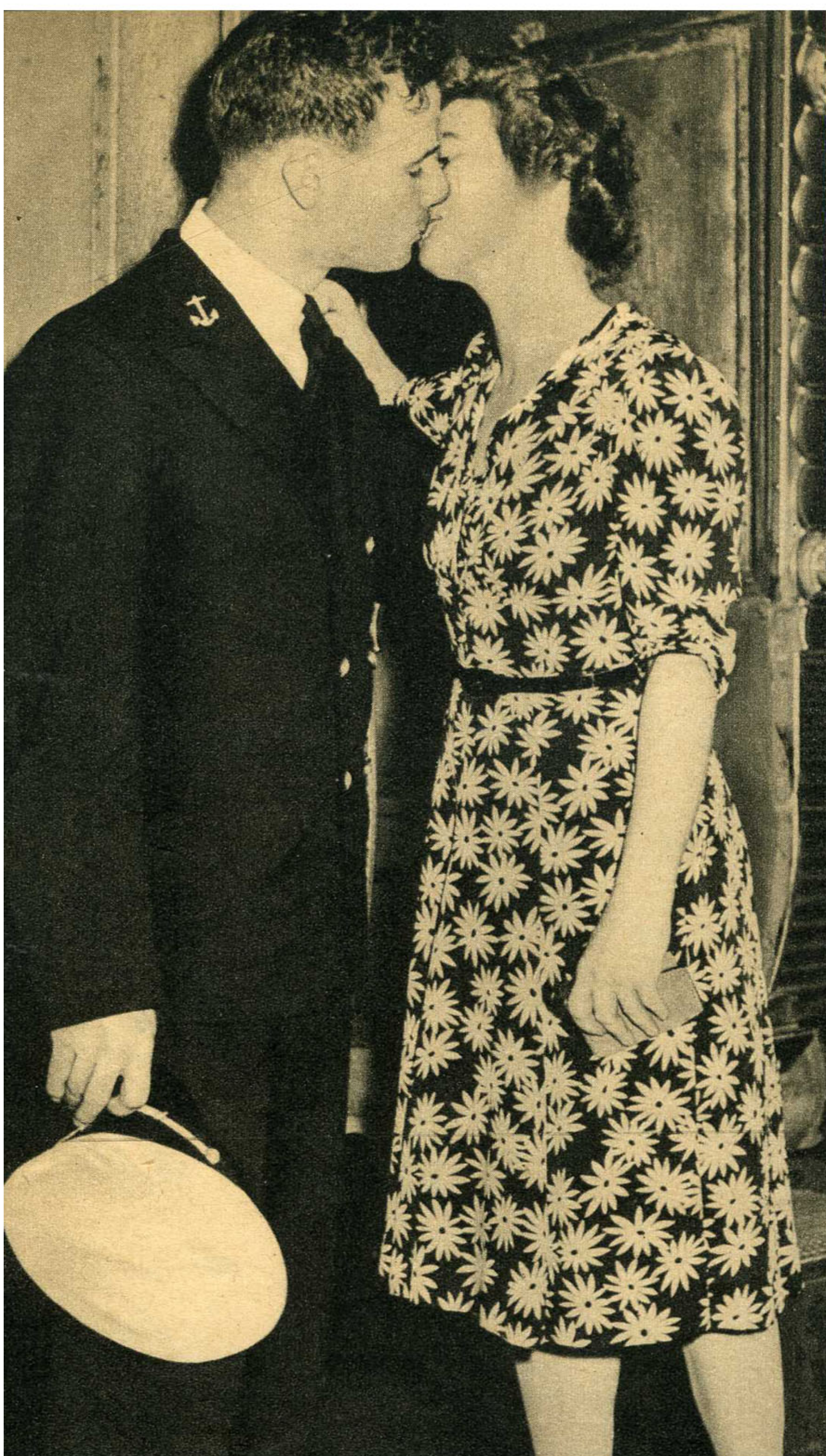
Good-by and good luck from the navy to a WAAC. Lucky candidates with friends or brothers stationed in Chicago were shown the town in a big way during the stopover between trains, seen off when they left.