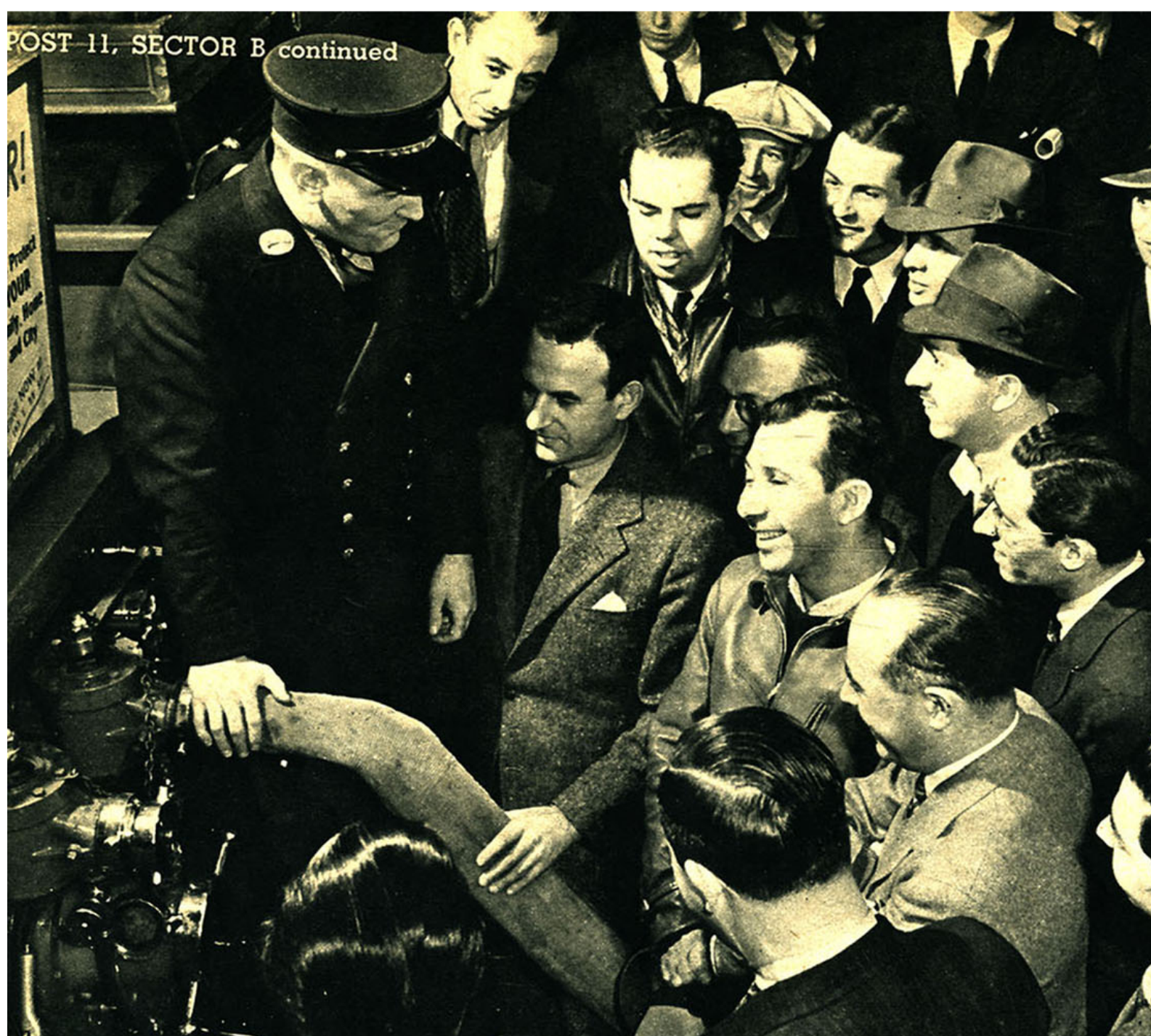
THE AUXILIARY FIREMEN OF THE NEIGHBORHOOD GATHER IN THE FIREHOUSE ON 51ST STREET FOR INSTRUCTION IN HOSE COUPLING IN HOSE COUPLING (NOTE VOLUNTEER POSTER)