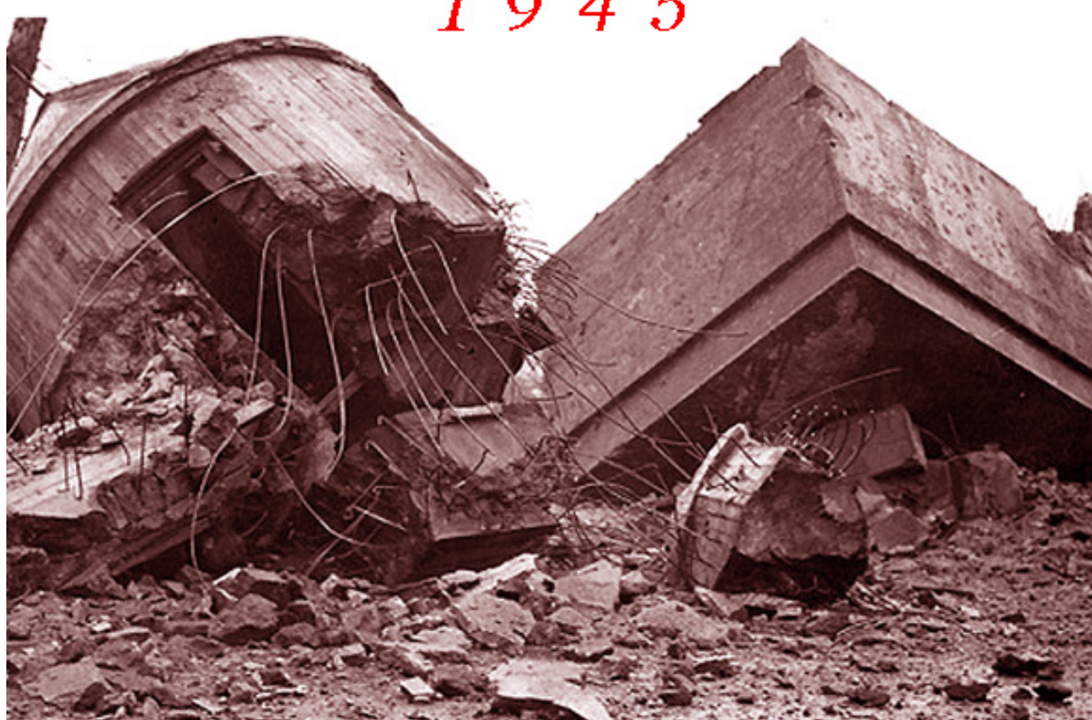
Blown-up bunker, hideout for Hitler and Eva Braun, was said to be dual "death" site

rine had proceeded through the Gibraltar Straits and across the Atlantic to Argentina.