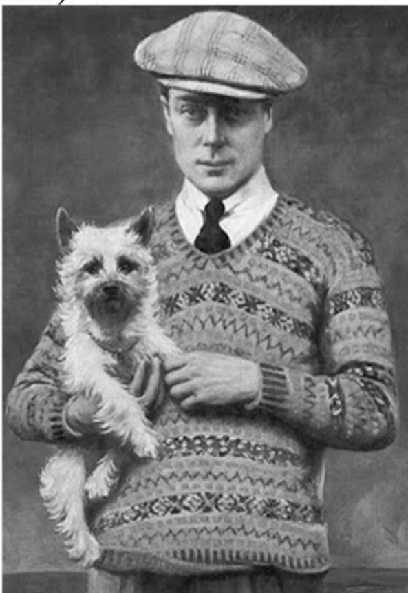
Edward VIII Wearing a Fair Isle Sweater

The tab collar (the rather high front soft collar with strips attached inside the outer fold and fastened over the collar button).