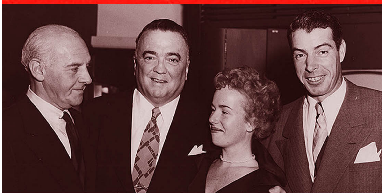
PUBLICITY VICTIM: HOOVER WITH GOOD FRIENDS WW & DIMAGGIO

T he Federal Bureau of Investigation is the victim of its own publicity.