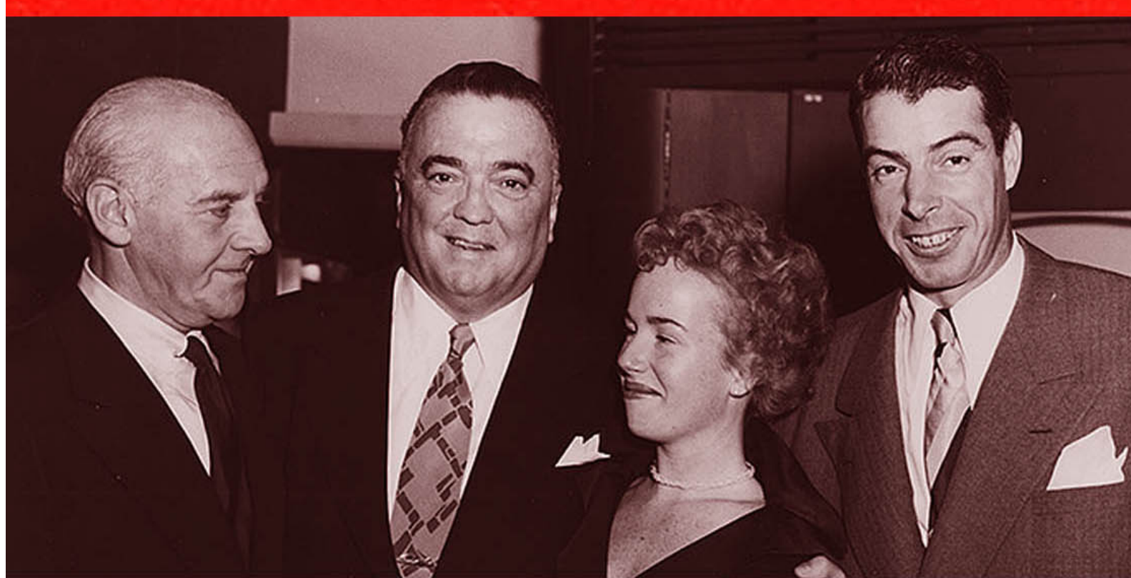
PUBLICITY VICTIM: HOOVER WITH GOOD FRIENDS WW & DIMAGGIO

T he Federal Bureau of Investigation is the victim of its own publicity.