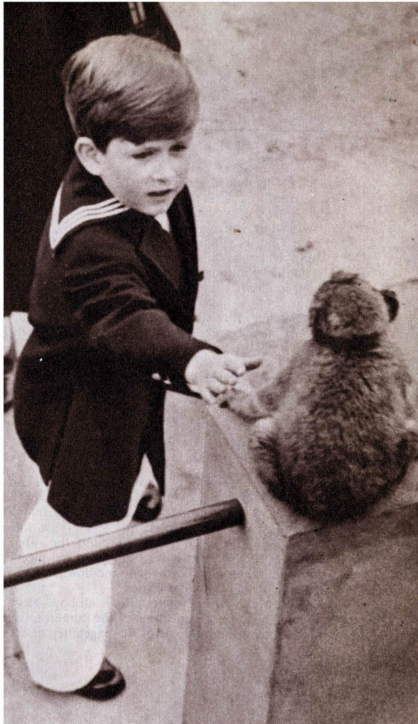
Charles tries to make friends with one of the apes at Gibraltar during royal family's visit

niture, 300 clocks, 250 telephones and a staff of 260 servants. Charles's own world within the palace is the nursery suite on the third floor of the right wing. It contains his bedroom and bath, Princess Anne's bedroom and bath, a schoolroom, sitting room and dining room.