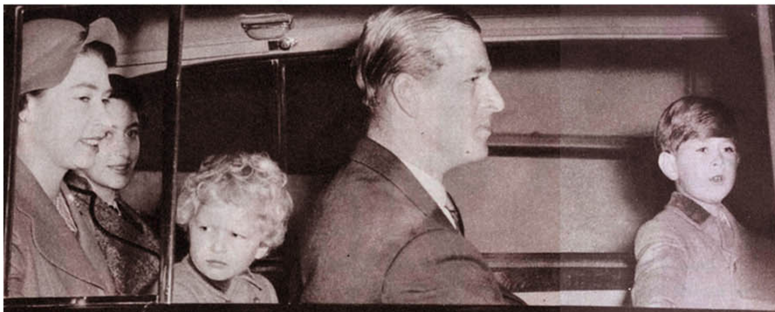
Prince Charles (right) and other members of the royal family return to London after Scottish vacation. Others are (from left) his mother, Queen Elizabeth; his aunt, Princess Margaret; his sister, Princess Anne, and his father, the Duke of Edinburgh

chief of the Cornwall Light Infantry, and that the Welsh are already calling for him to be created Prince of Wales—a plea his mother has not heeded because she thinks him too young for the elaborate ceremonial involved. He does know that his mother is queen, but takes the fact in his stride. Recently someone referred in his presence to Her Majesty. "Who is Her Majesty?" he asked. "The queen," he was told. "Oh," he said, "you mean my mummy."