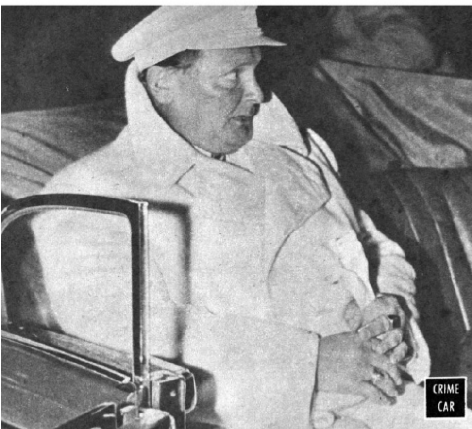
In rear seat of especially-built, bullet-proof Mercedes cabriolet, Reichsmarschall Hermann Goering

sadly contemplates then-uncertain future. Later, on May 9, 1945, he surrendered to the U. S. Army.