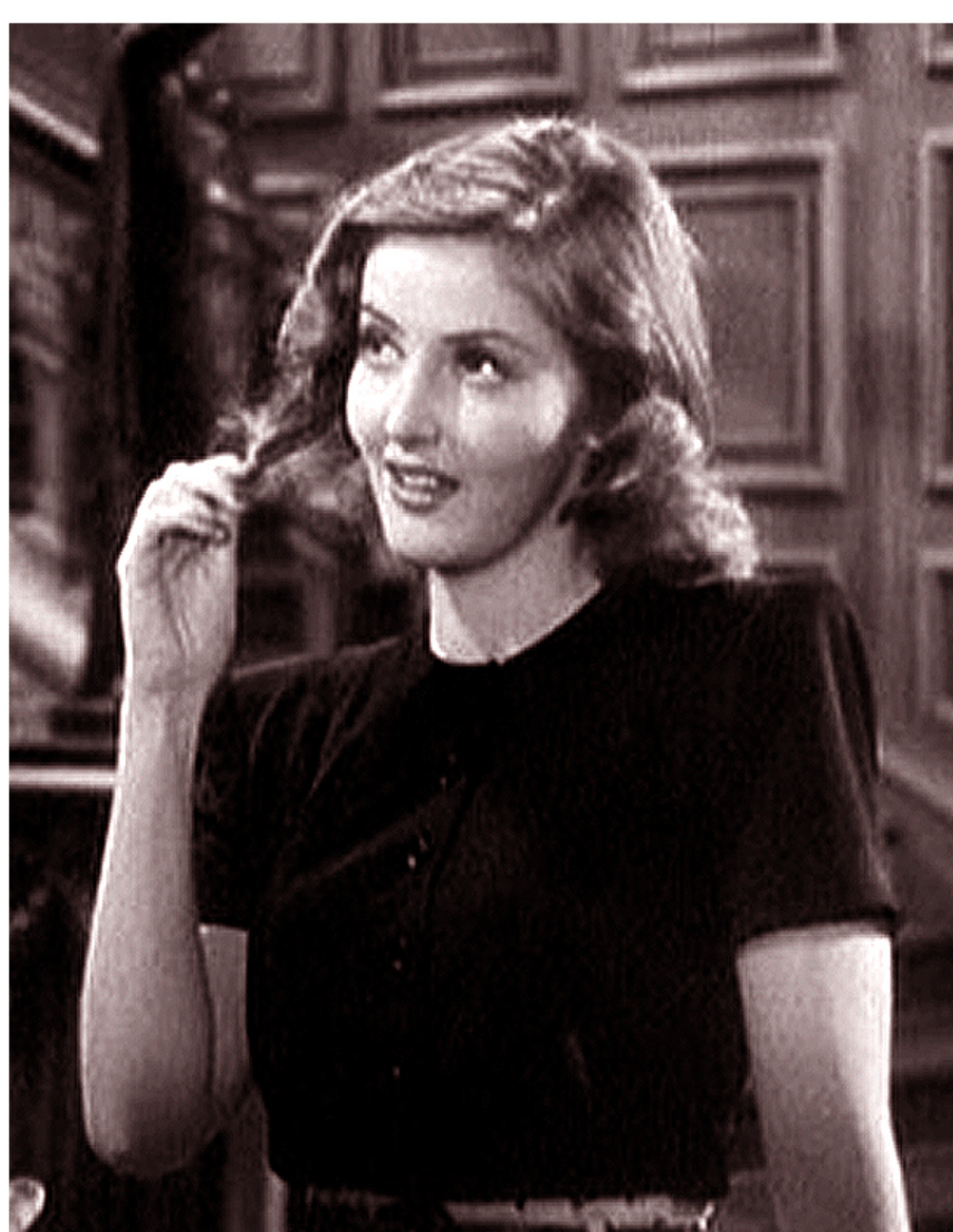
~as "Carmen Sternwood" in The Big Sleep

Miss Vickers was born in Ann Arbor, Mich., on May 28, 1925. Her father worked for the Ford Motor Co. and, consequently, Martha spent her early years in Chicago, Miami, St. Petersburg, Detroit and Dallas before going west with her family in 1940.