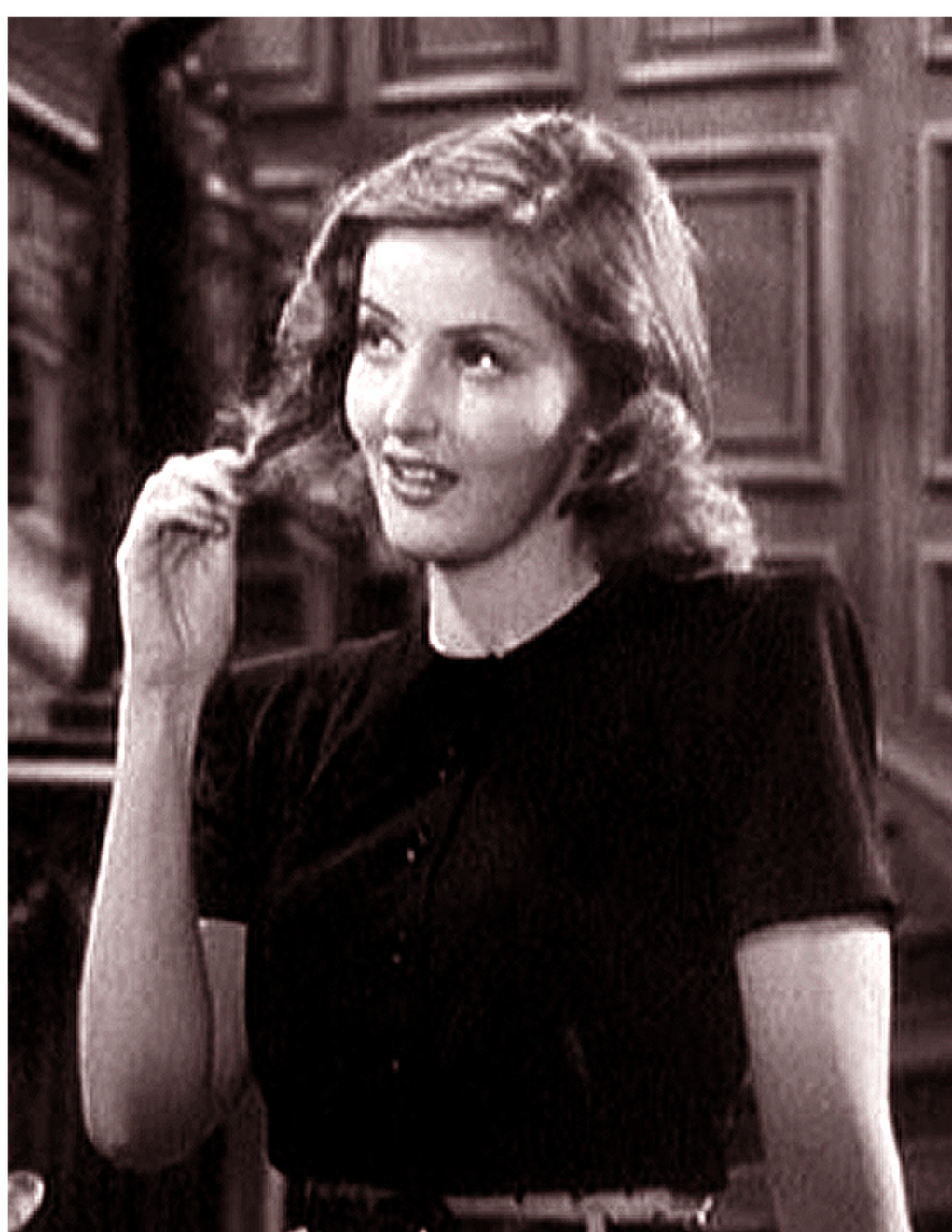
~as "Carmen Sternwood" in The Big Sleep

Miss Vickers was born in Ann Arbor, Mich., on May 28, 1925. Her father worked for the Ford Motor Co. and, consequently, Martha spent her early years in Chicago, Miami, St. Petersburg, Detroit and Dallas before going west with her family in 1940.