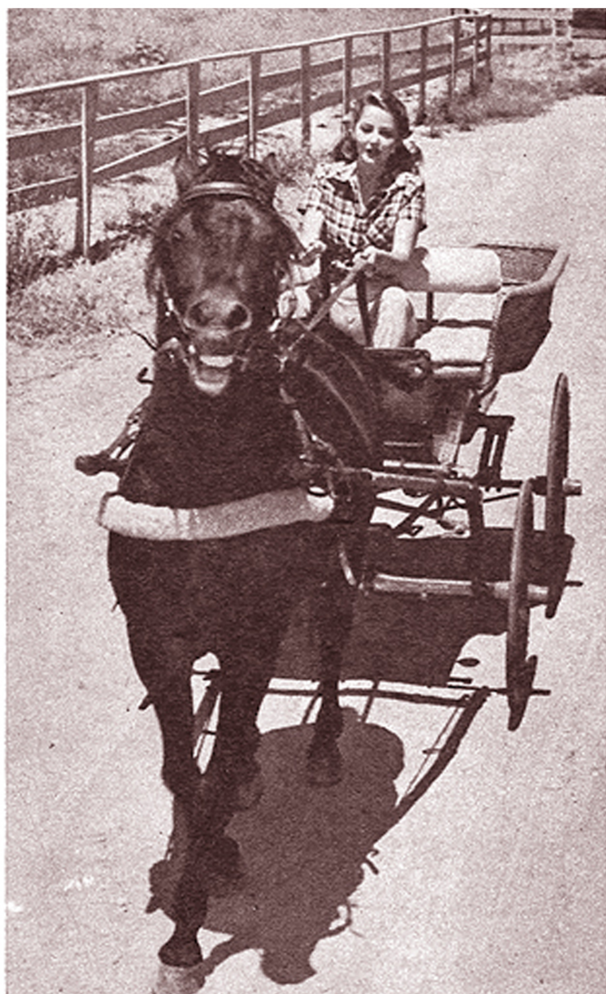
MISS VICKERS drives the hackney show pony while visiting on Harry Warner's ranch estate.

Miss Vickers has completed one picture since "The Big Sleep" and is currently working in a third, so there is a possibility that she will have completed three films before the public gets a glimpse of her on the screen. Her second picture is called "The Time, the Place and the Girl" in which she has the leading feminine role opposite Dennis Morgan and Jack Carson. She is currently working in the picture called "The Man I Love" in which she will have featured billing along with such other important players as Ida Lupino, Robert Alda and Andrea King.