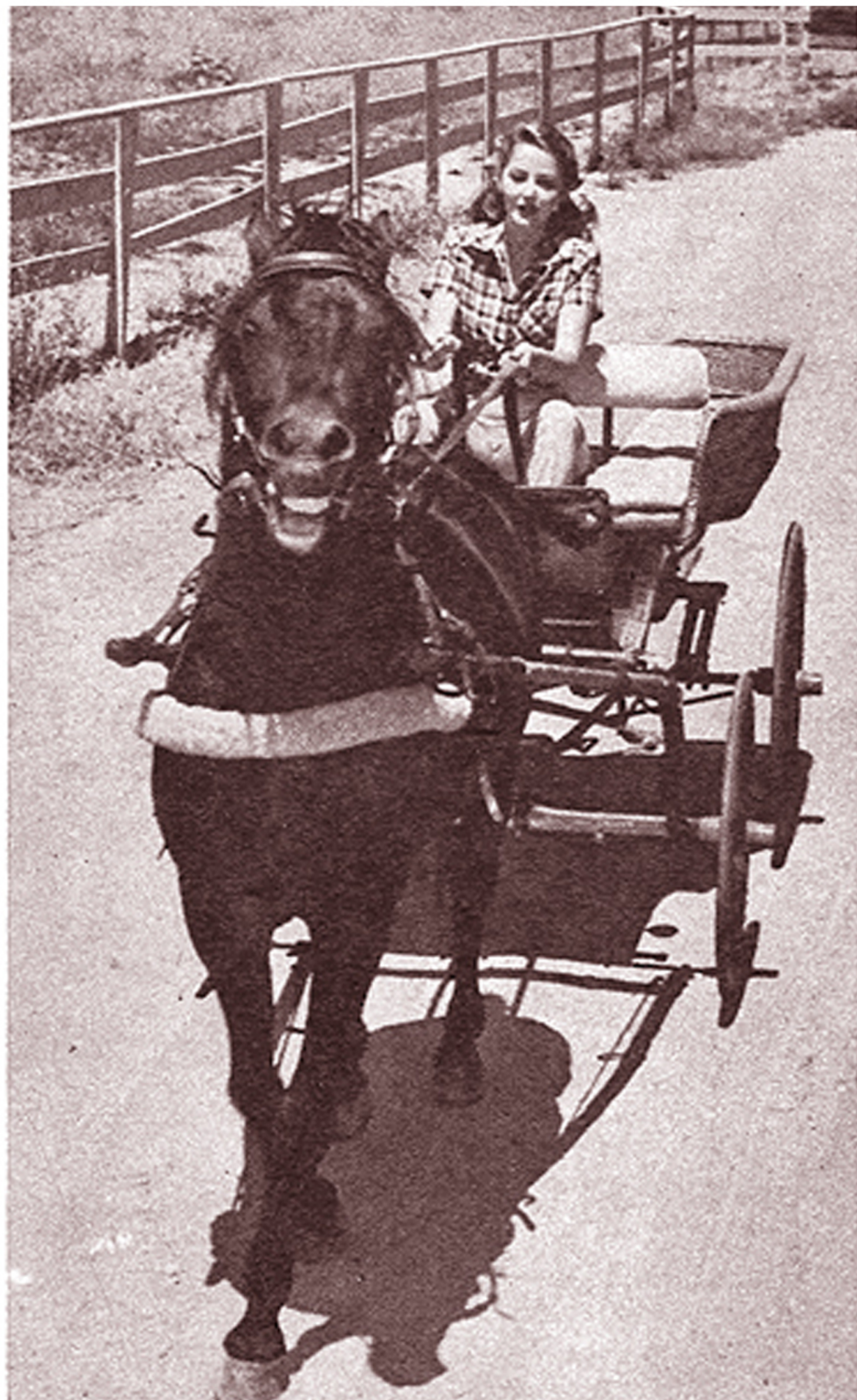
MISS VICKERS drives the hackney show pony while visiting on Harry Warner's ranch estate.

Miss Vickers has completed one picture since "The Big Sleep" and is currently working in a third, so there is a possibility that she will have completed three films before the public gets a glimpse of her on the screen. Her second picture is called "The Time, the Place and the Girl" in which she has the leading feminine role opposite Dennis Morgan and Jack Carson. She is currently working in the picture called "The Man I Love" in which she will have featured billing along with such other important players as Ida Lupino, Robert Alda and Andrea King.