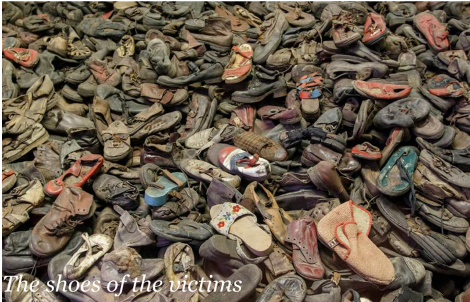
The shoes of the victims

This rise in deaths was due to starvation and typhus. Remember this was a camp for interned political prisoners. Hitler's own finance minister, Doctor Schacht, as well as Marshal Stalin's stepson and the last Austrian chancellor Doctor Schuschnigg and others of similar character were there. Most of these eminent men survived but nowhere since the Dark Ages has death been a more frequent visitor than at Dachau during the twelve years of Nazi rule.