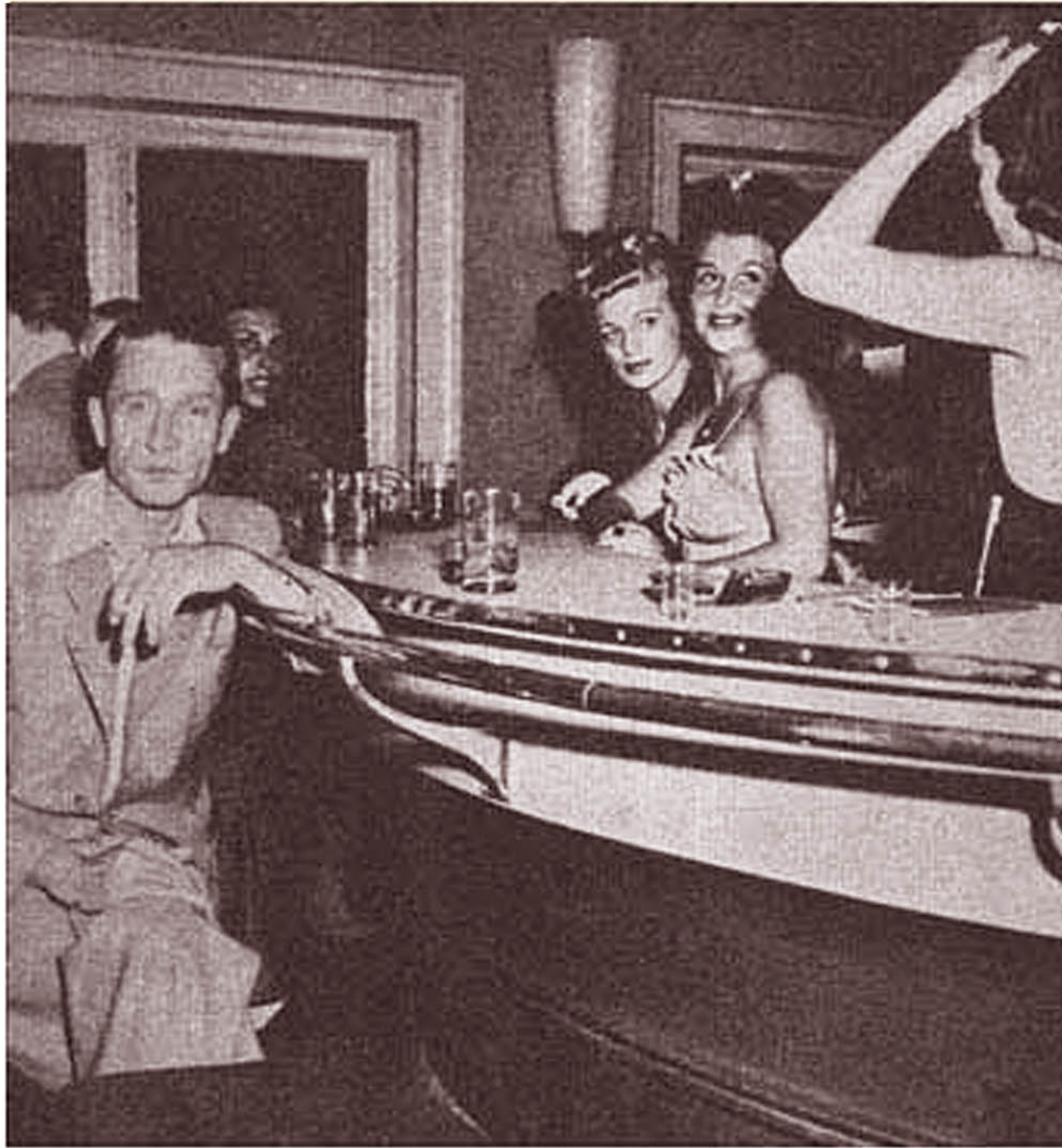
Under Allies , living conditions in West Zone improve. Necessities are available, some luxuries. In Berlin bar above barmaids wear evening dress on Saturday.