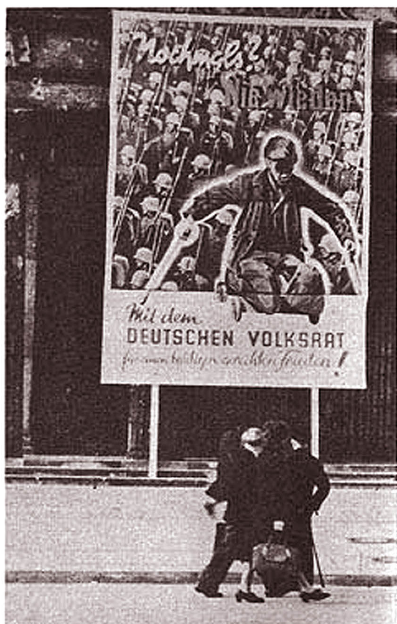
Red poster on Germany's Tomb of Unknown Soldier shows amputee, troops. "Again?" It asks, innocently.