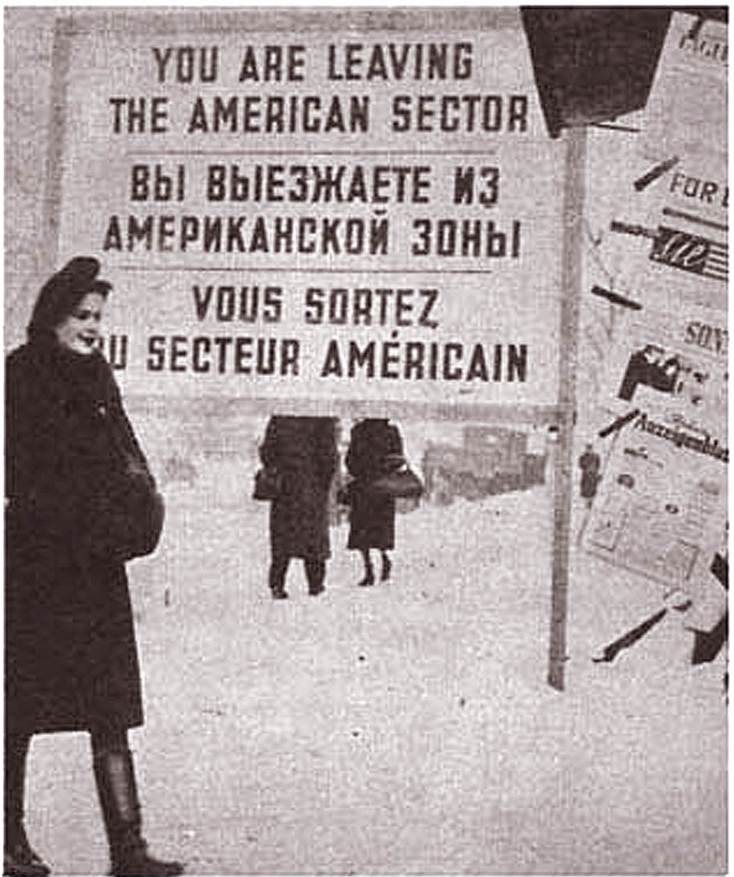
Communist papers , even Red Army's Taegliche Rundschau (top right), are sold at stand in U.S. sector. Germans choosing reaction had chance to hear all sides.