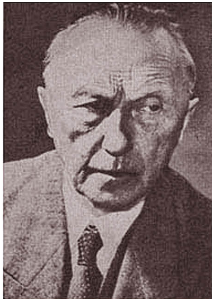
KONRAD ADENAUER , Chancellor of Right-faced West German Government, despite Allied High Commission's ban on militarism, says West must ape East in rearmament.