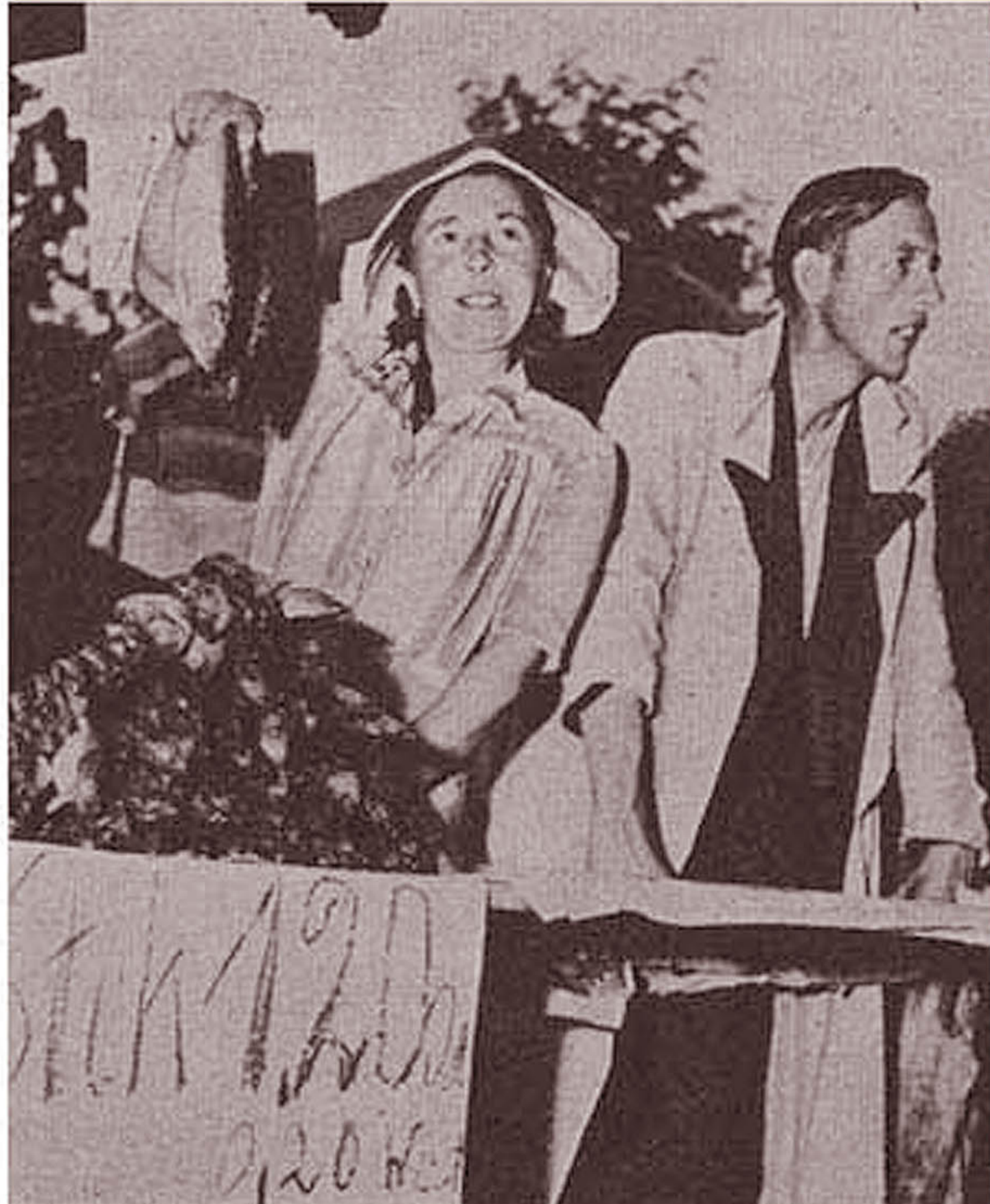
Saleslady in Western Zone offers unrationed fish. There are some food shortages in West. But Germans cannot claim deprivation drives them to Nazism.

Bonn government and the Western Allies about establishing a new German army.