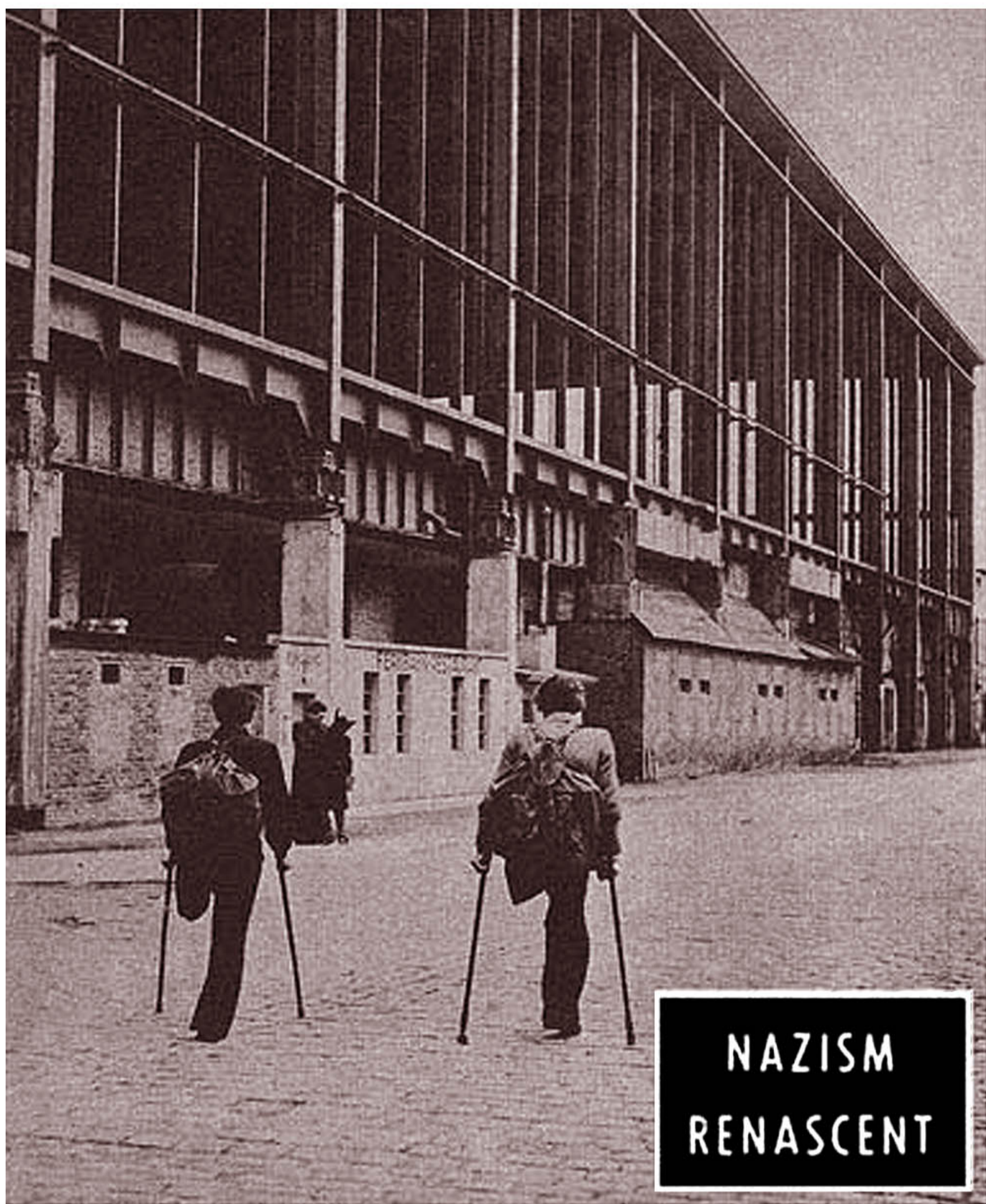
WORLD WAR II CASUALTIES ROAM GERMANY'S STREETS NEVERTHELESS; MILITARY-MINDED RED-EAST ZONES REBUILDS ARMY