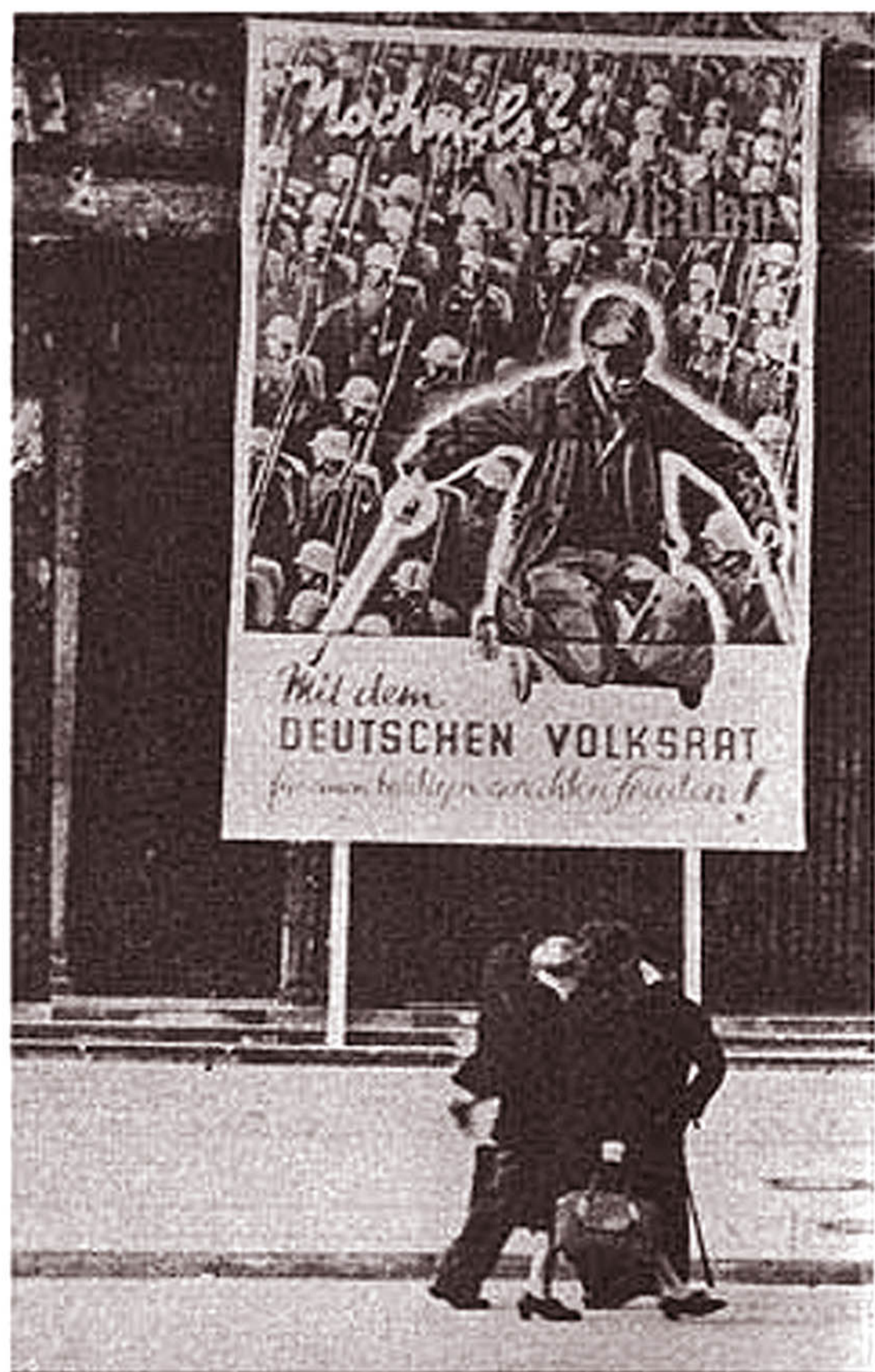
Red poster on Germany's Tomb of Unknown Soldier shows amputee, troops. "Again?" It asks, innocently.