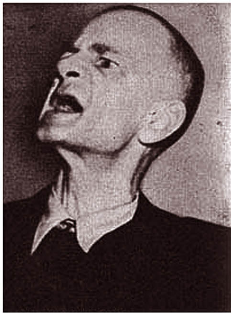
KURT SCHUMACHER , head of Socialist Party, leads opposition to Adenauer, but also sounds nationalistic. German Socialists proved pitifully unable to bar Hitler in 1933.