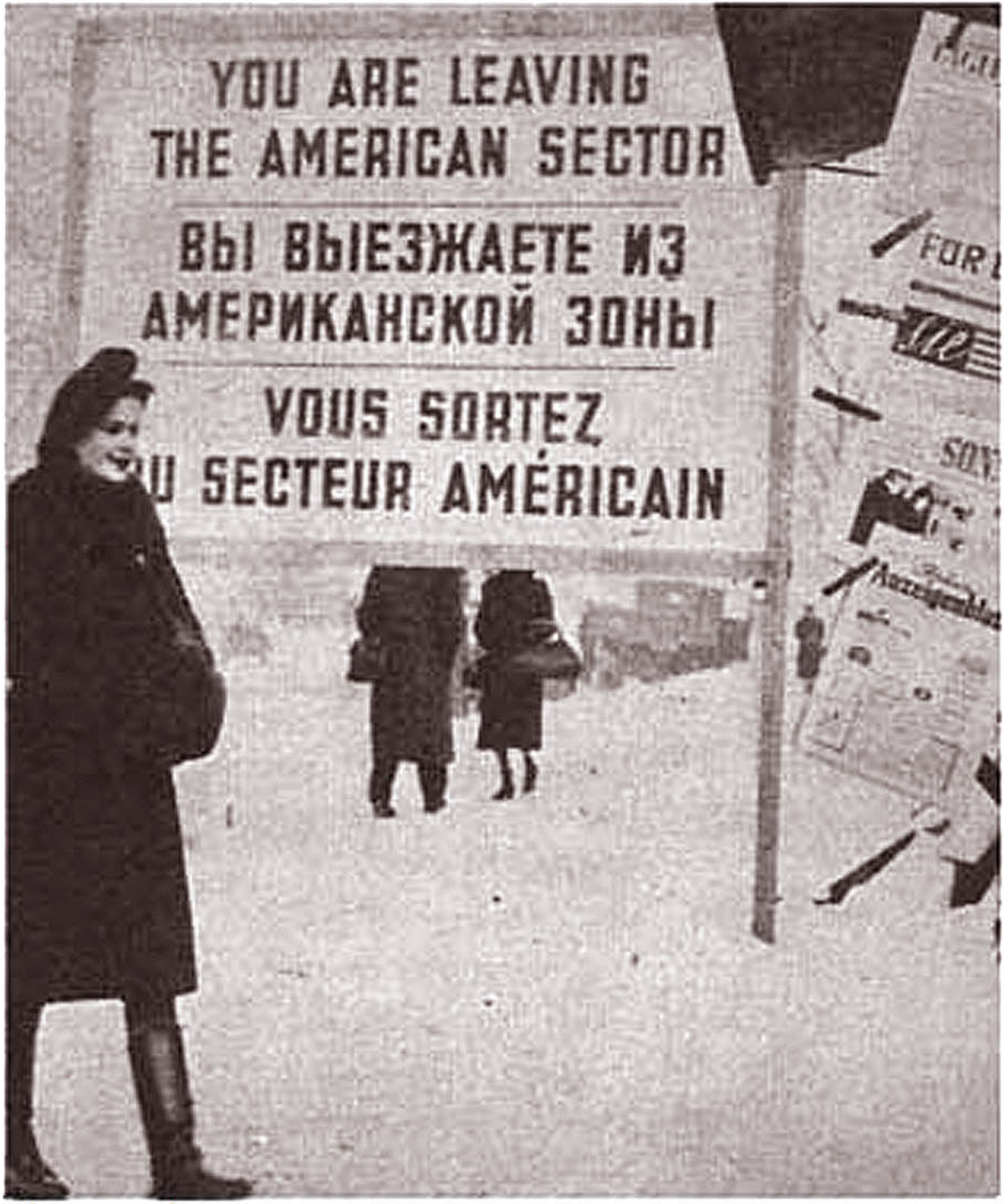
Communist papers , even Red Army's Taegliche Rundschau (top right), are sold at stand in U.S. sector. Germans choosing reaction had chance to hear all sides.