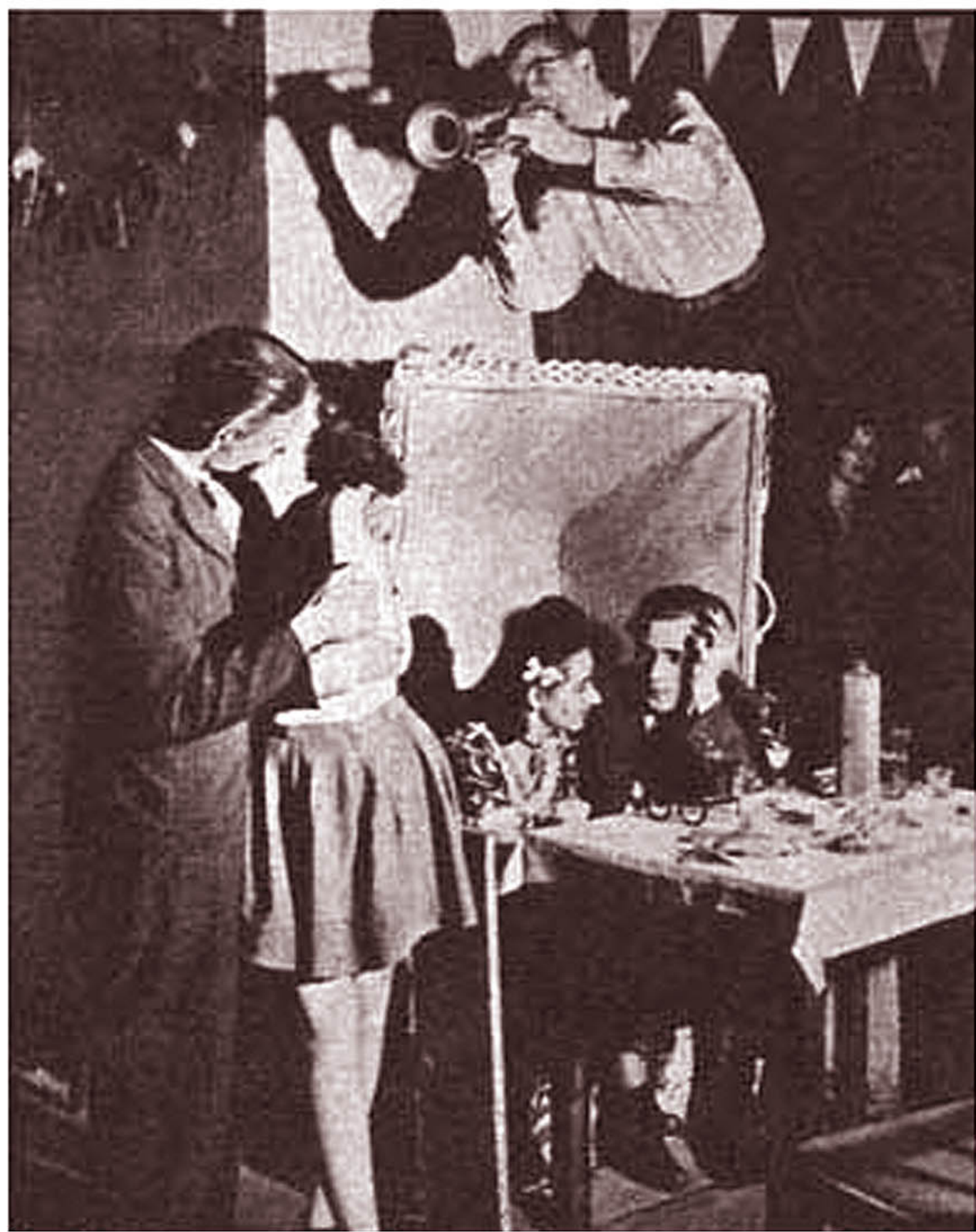
Reviving nightlife indicates West Zone's easier economic state. With beach chairs, hostesses in playsuits, this nightclub is decorated to suggest seashore.

a "sovereign" state could not exist without its own army. Thus the delighted Germans learned of the rebirth of a German army in the East. Obviously it would arise from the police force whose numbers had swollen to nearly 300,000.