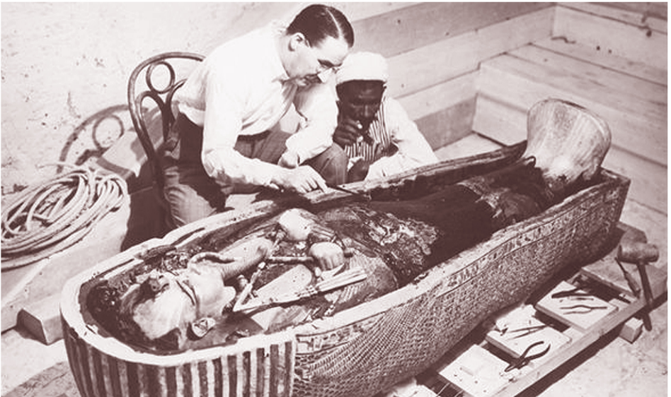
Howard Carter examined the sarcophagus