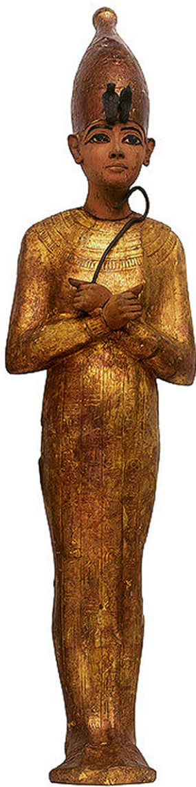
The Shabti of Tutankhamun

"One of the finest objects is the chair or throne of the King. It is in wood. The back panel is of surpassing beauty, and portrays the King and his Queen protected by Aton rays. All the figures, etc., in this scene are built up by means of semi-