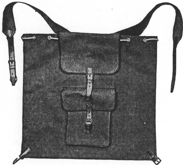
Square Pattern, 18/6.

The Rucksack is not so general a feature of an Officer's equipment since the Army Order of January 22, 1914 (see page 19), but particulars are given, as when permissible to be worn, it has advantages over the pack. It is lighter