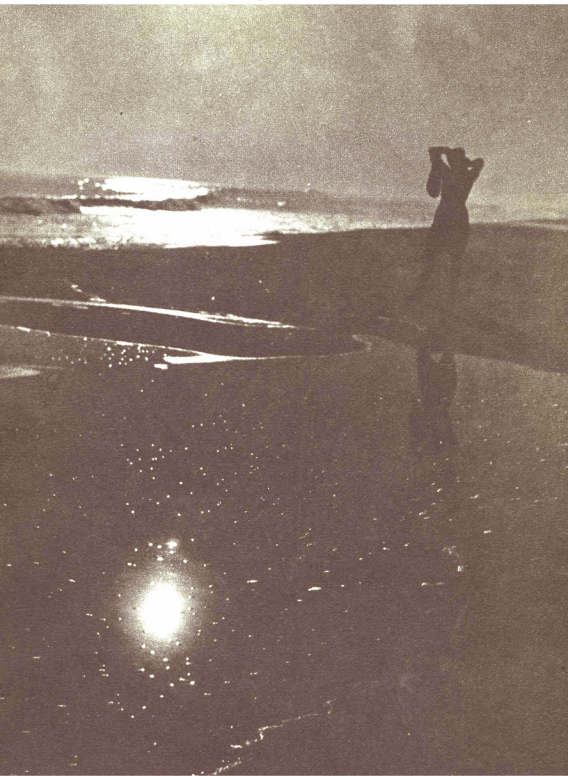
Damien Shaw stands on the Bermuda beach at sunset. Still another Krainin mood.