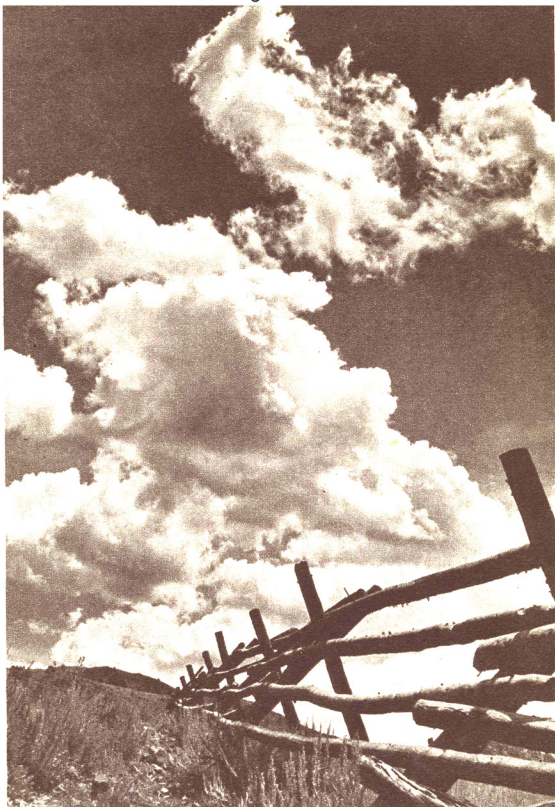
This is the A-Bar-A Ranch in Wyoming. The cloudscape shows Krainin's versatility.