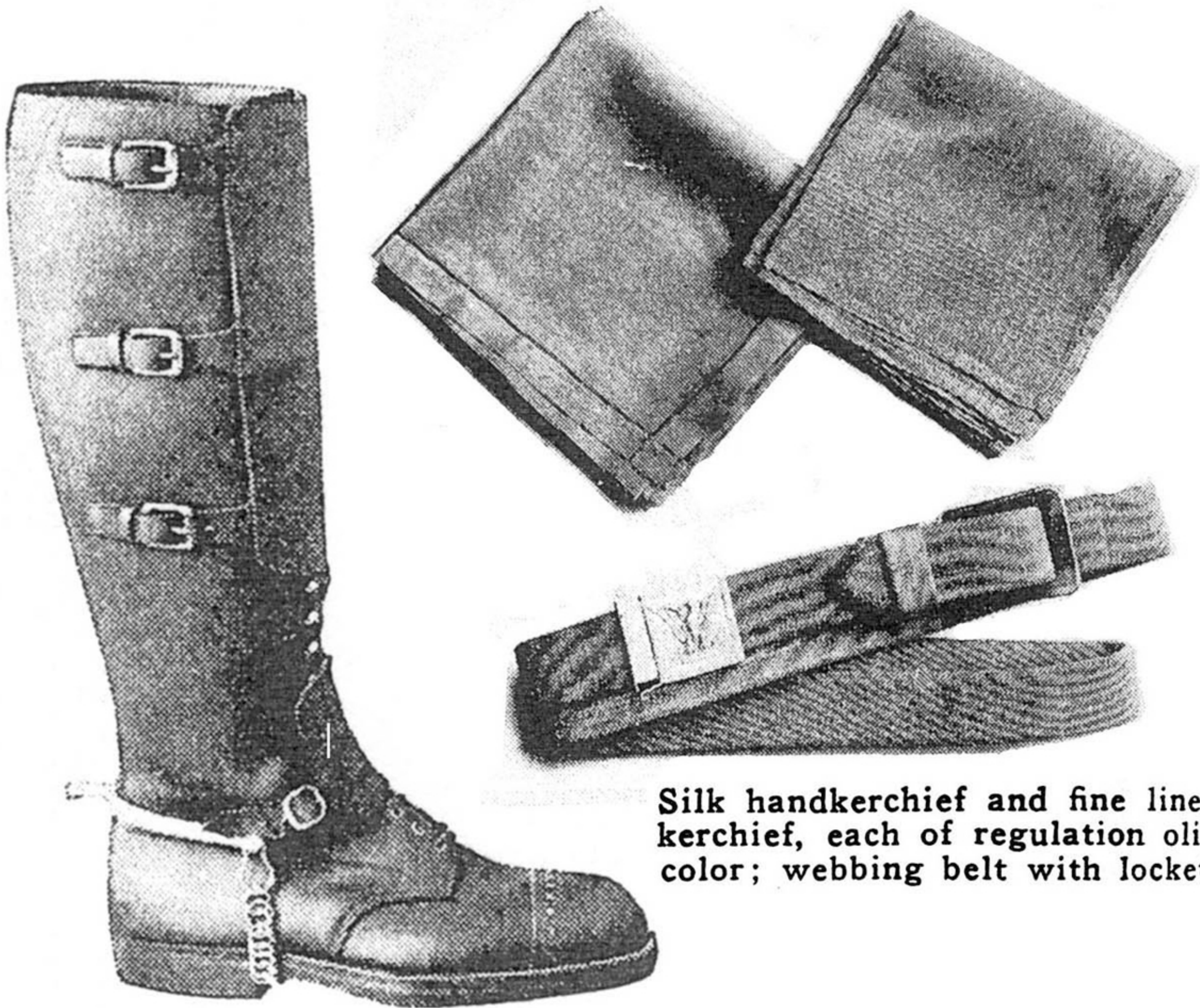
Silk handkerchief and fine linen handkerchief, each of regulation olive drab color; webbing belt with locket holder

On the left, khaki shirt of light weight flannel; black silk knitted scarf. On the right, light weight silk and wool shirt worn with officer's white stock