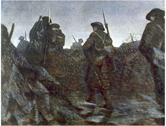
Relief at Dawn by Nevinson (1918)

From a purely artistic standpoint there are two ways in which a painter can make history—he can discover a new way of painting an old subject, or he can discover a new subject. It was Mr. Nevinson's peculiar good fortune to be able to do both. Though different in scale and kind from any preceding war, there were troops marching along country roads and fighting in trenches centuries before 1914. With regard to scenes of this description Mr. Nevinson may be said to have discovered a new way of treating an old subject. But never before, save in the brains of romancers, had there been a war in the air, and the aeroplane provided the artist with a new subject of which Mr. Nevinson was quick to take advantage. "Taube Pursued by Commander Samson" was the first of a series of pictures illustrating phases of aerial warfare, of which one of the largest and most important is here reproduced (page 174). "Air Battle: Winning of V.C. by Captain Bishop," was painted by Nevinson in the summer of 1918 for the Canadian War Memorials Fund, and is historically accurate even to the position of the two other aeroplanes when the victorious airman destroyed his first enemy, who is here shown crashing to ruin.