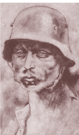
"HEAD OF A GERMAN." From a drawing by Sir William Orpen, one of the official artists on the western front.

a bending road for his subject, Mr. Nevinson in the first painting of the series conveys an impression of the endless chain of vehicles going up to the front through country unravaged by the war. The very poplars diminishing in the distance all add to the suggestion of infinity. In the second painting the big guns are seen passing through the area of aeroplane observation and frontal light railways. The third shows infantry and horse artillery, beyond the dumping grounds, passing over country recently recaptured. The emphasis on the diagonal lines of the advancing infantry is more subtle here than in the earlier "Returning to the Trenches," but the method is the same, and an admirable suggestion of movement is again the result. Equally successful is the treatment of the gun-team, the taut legs of the animals eloquently conveying