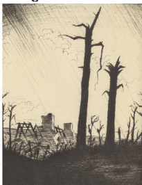
"Reclaimed Country" (1917)

Just as Dr. Johnson maintained that there was some good to be got out of every book, so it may be urged that there is some good to be got out of every artistic theory. The particular good thing to be got out of the work of the Italian futurists was their successful rendering of the suggestion of movement. This was obtained by a generous use of slanting lines in the composition, and this convention not only gives life and movement to such a painting as "Returning to the Trenches," but used regularly and with an avoidance of curves it also tends to suggest the movement of a vast machine rather than of individual human beings. It was the peculiar distinction and triumph of Mr. Nevinson to leave aside all the extravagances of futurism and snatch from it the two things that helped him to render realistically a new world in a new way. From the very first he stood apart from all other painters of the war