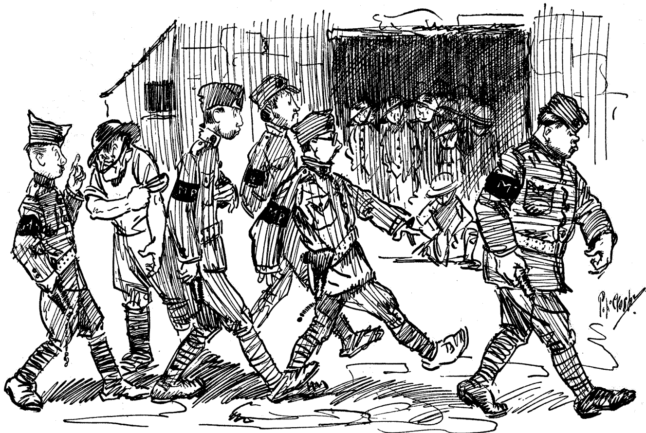
"We were split up two and two and sent around to various villages to do the town constable act. I cannot recall our coming ever being received with cheers"

And then there descended on us, marching at attention with their band in front, the Umptieth Infantry Regiment, returning from their parade