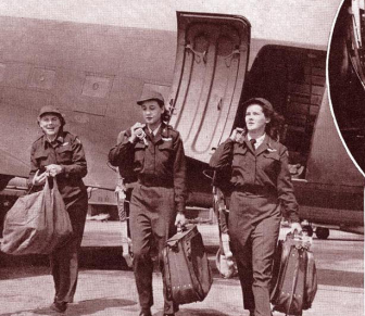
WASPS at New Castle Air Base in Delaware hoist their equipment as they leave their huge plane.