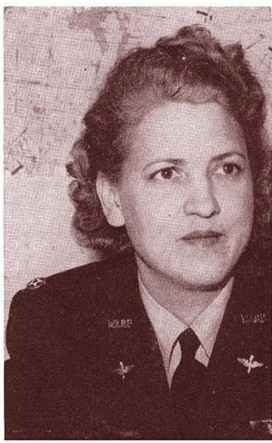
MISS JACQUELINE COCHRAN, Director, Women Pilots Program