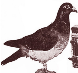
'President Wilson' lost a leg at Verdun