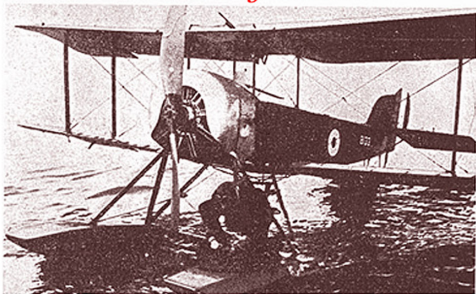
Releasing a pigeon from a seaplane

necessary in organizing the pigeon companies, but it was done, and the birds of the U. S. Army flew fast, straight and true and were a credit to the country from which they came. As a basis for organizing the pigeon service, our army had hundreds of instances in its possession showing how the pigeons with the French, British, Russians and Italians had rendered substantial service always and invaluable service hundreds of times. Not infrequently, the barrages which the Germans put over would entirely destroy all means of communication between advance troops and general headquarters, and that was when the feathered aviator did his bit. It was under such conditions that pigeons carried messages at the first battle of the Marne, at the Yser in Flanders, and aided the British in the capture of Neuve Chapelle. Pigeons died with the British Tommy at the second battle of Ypres when the Germans in their advance towards the Yser Canal used poison gas for the first time, after which gas-proof baskets and cotes were provided for them.