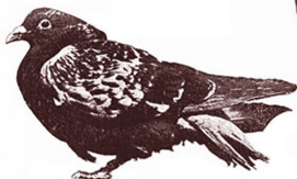
"Cher Ami," saviour of the Lost Battalion