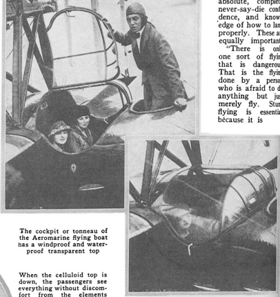
The cockpit or tonneau of the Aeromarine flying boat has a windproof and water-proof transparent top.

And now that women are learning to fly they will soon be as important an influence in aviation as they are in motoring. Among other things, it is probable that many of them will select the type of airplanes they wish their husbands to buy.