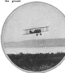
That exhilarating moment when you realize that you are actually off the ground