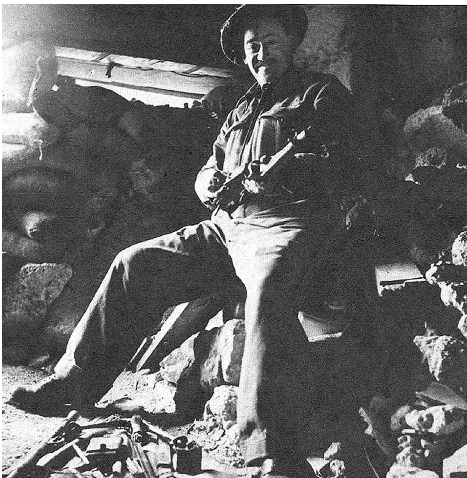
A KIWI, WHOSE HIGH SPIRITS EASILY COME THROUGH THE SHADOWS, CAREFULLY CLEANS HIS BREN GUN.

Coming out of the dark, I found even this light seemed bright. There were many coats and blankets lying on the floor, some American and some British. I plopped down and wiped some of the sweat off my face.