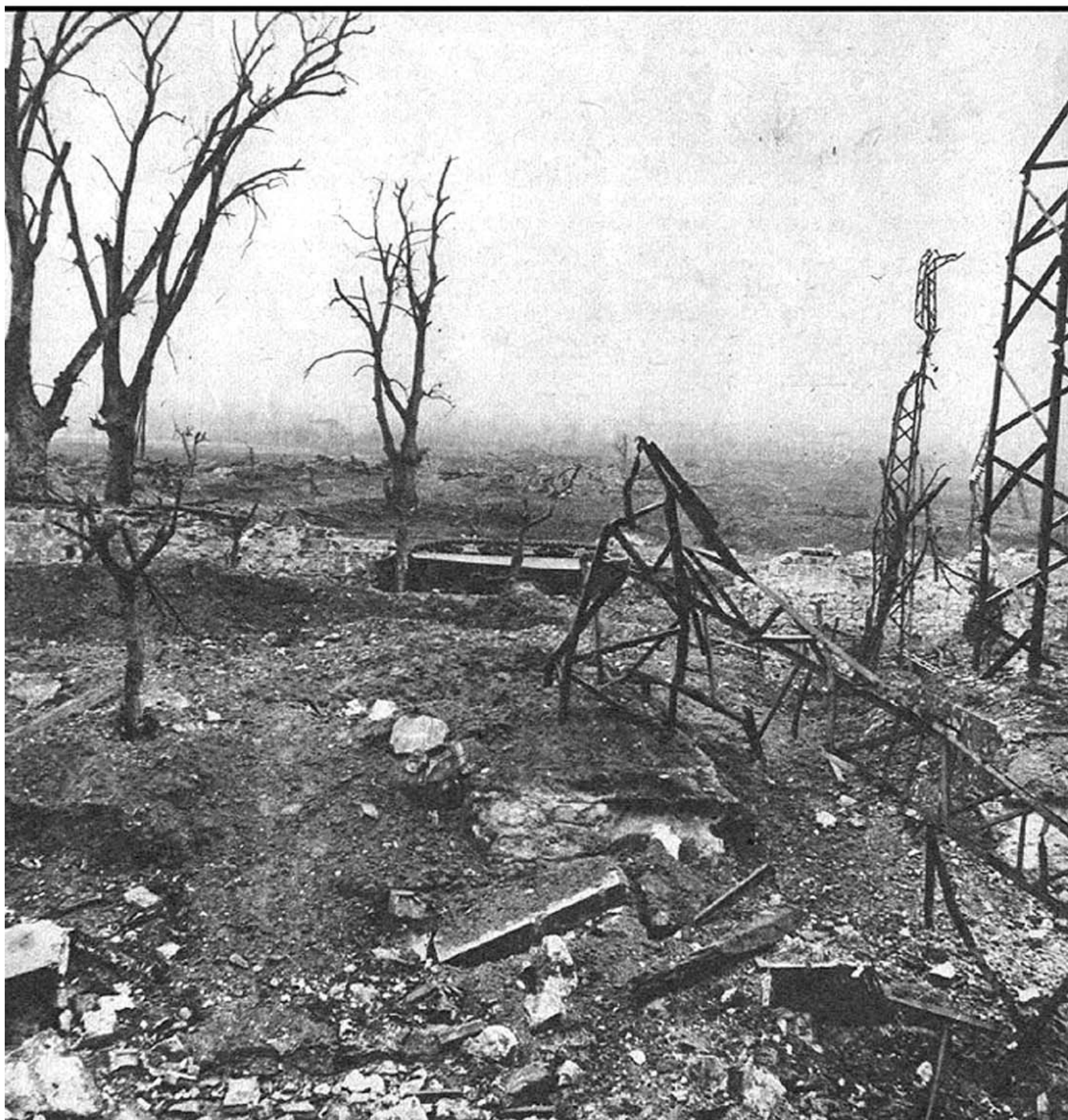
THIS WAY FOR THE VALLEY OF THE PURPLE HEART. IN THE CENTER: AN OVERTURNED SHERMAN TANK.

I didn't feel like going back to bed and decided to look around the place. As I came up the stairs out of the cellar, I saw two Kiwis on guard at the window of a room right across the way. There were two guards at the lookout window at the opposite end of the room and two guards at the only entrance to the house. They all had tommy guns.