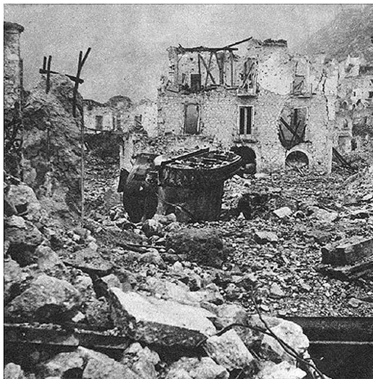
STREET SCENE IN CASSINO

T HERE was little doing the rest of the day, and life in a Cassino fortress seemed pretty dull. The boys had a pin-up of Marguerite Chapman, salvaged from a beat-up British magazine. They also had a bottle of Scotch, donated by some