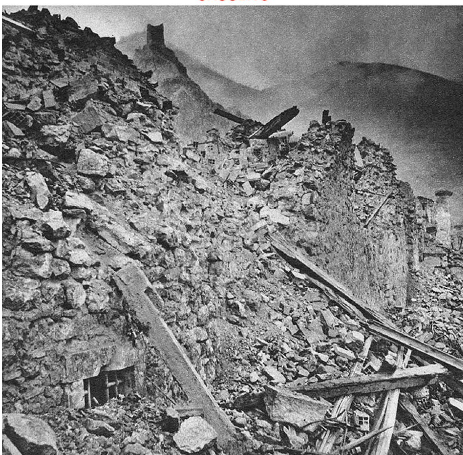
RUBBLE EVERYWHERE, AND STICKING UP IN THE BACK A CASTLE—THAT IS, ITS REMAINS—NOW IN OUR HANDS.

explaining that it was a spot along our route that the Kraut sprayed every so often in the hope of catching just such a party as ours. "We've been pretty lucky so far," he said. "He's just missed every time."