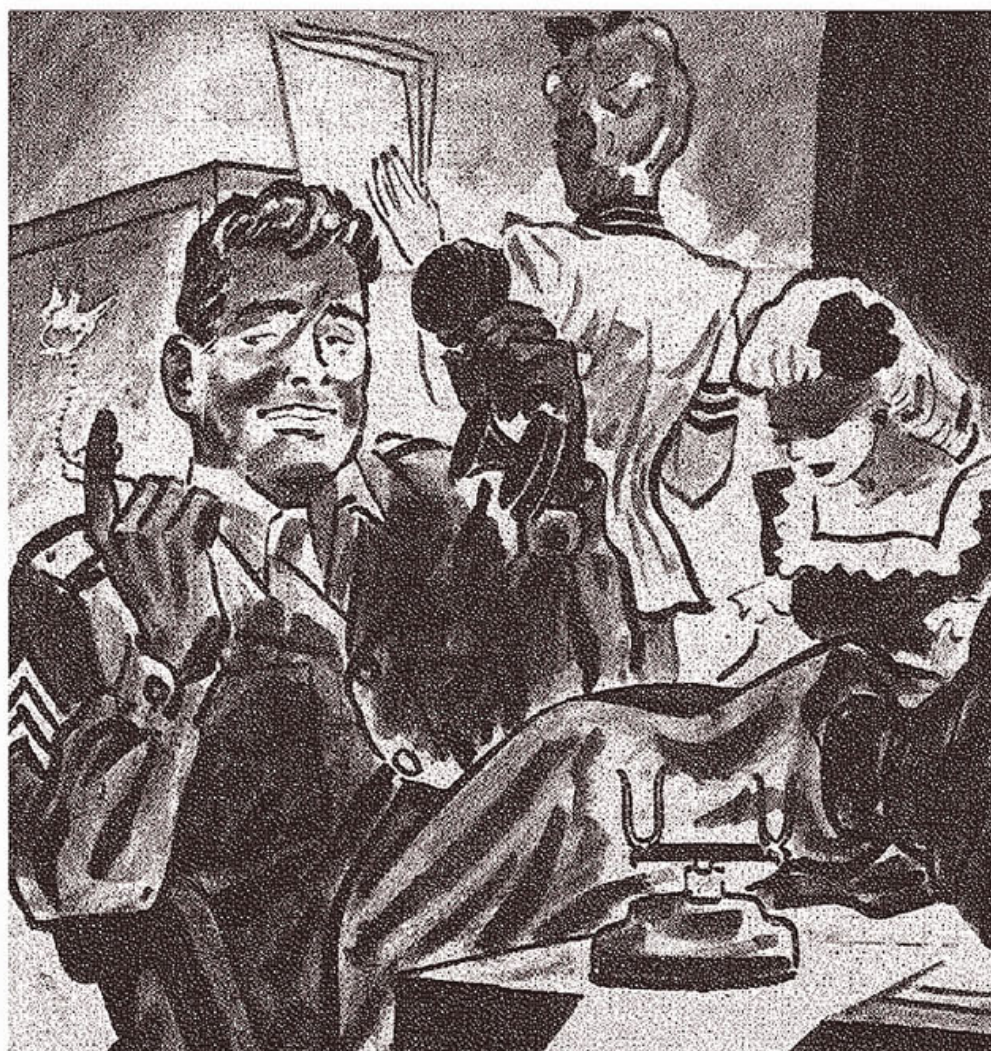
One lone operator set himself up in a swank office.

basis in their own stolen trucks. This cut down his administrative headaches.