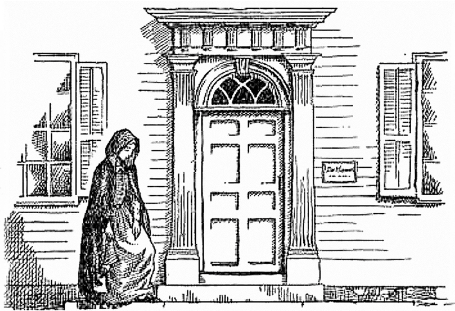
"Prudence Crandall, Woman of Courage"

Four years later, on January 28, 1890, she died.