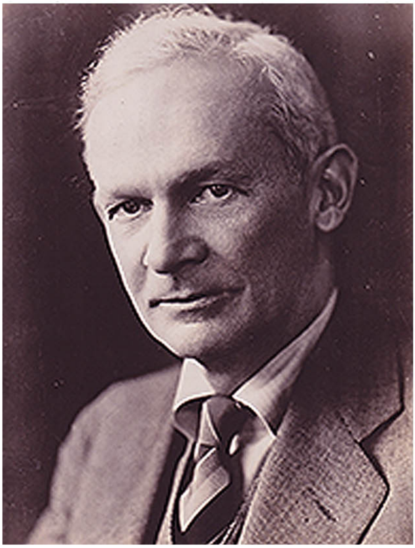
Mellett Outlined the Region's Paradox

POVERTY: Amid this plenty, nevertheless, the South is poor. In the region are as many farmers as in the rest of the United States together; yet the South's 3,750,000 farm families receive only one-fourth of the nation's farm income. The South's 1,900,000