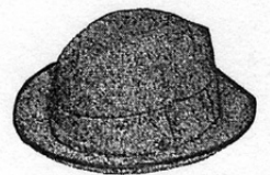
English cheviot knockabout hat, for golf or motoring, $3.50