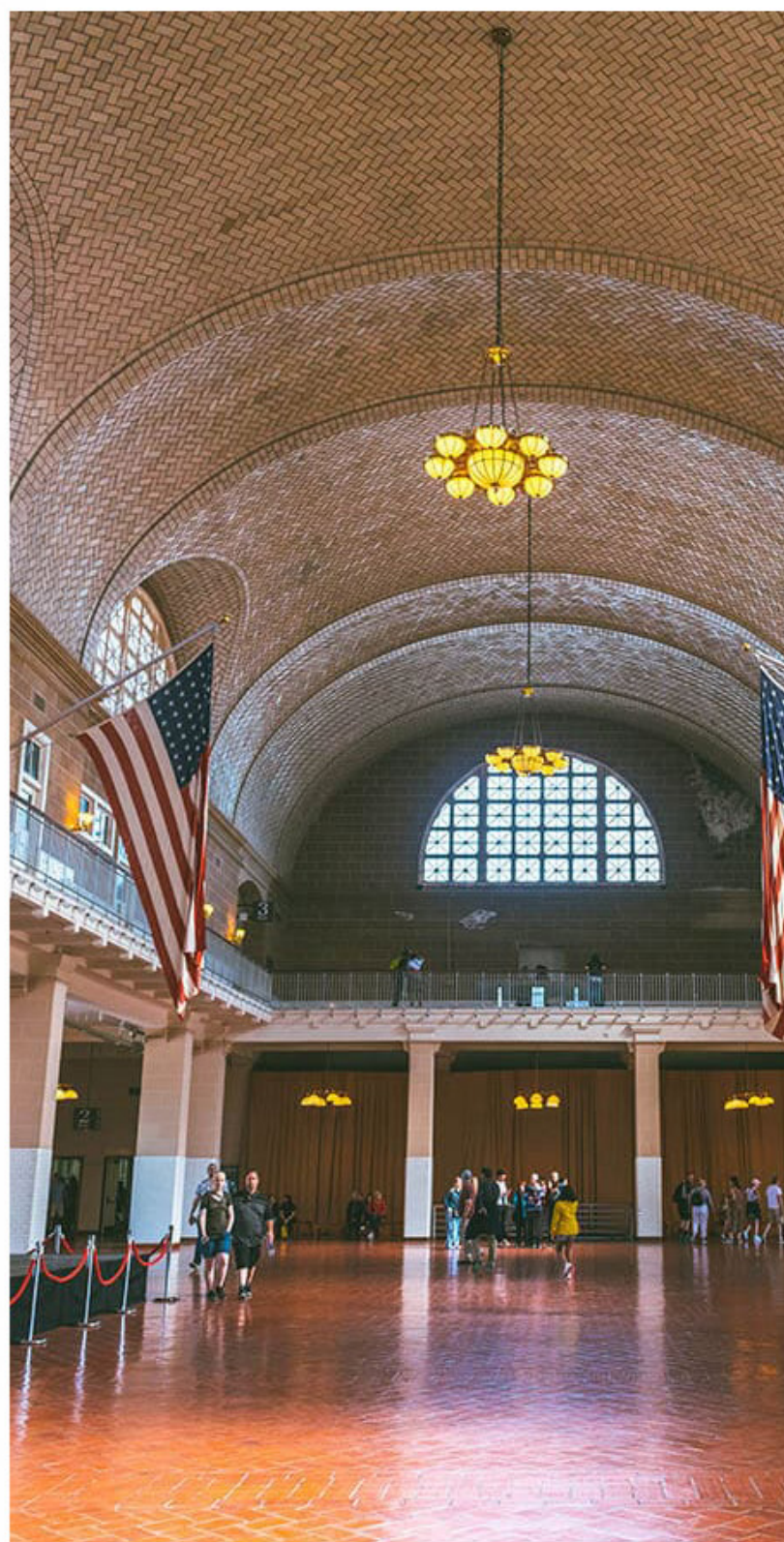
Ellis Island Museum, 2019