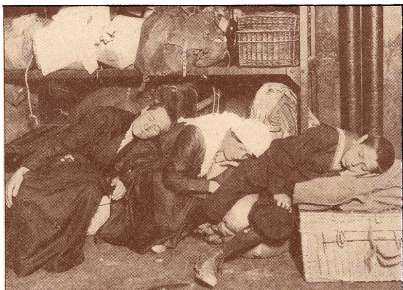
FUTURE AMERICANS "PUTTING UP" WITH UNCLE SAM.

Over a thousand immigrants were recently forced to sleep on blankets spread on the floors in overcrowded Ellis Island. Our treatment of the immigrant is "criminal," declare several investigators, and Commissioner Wallis agrees with them.