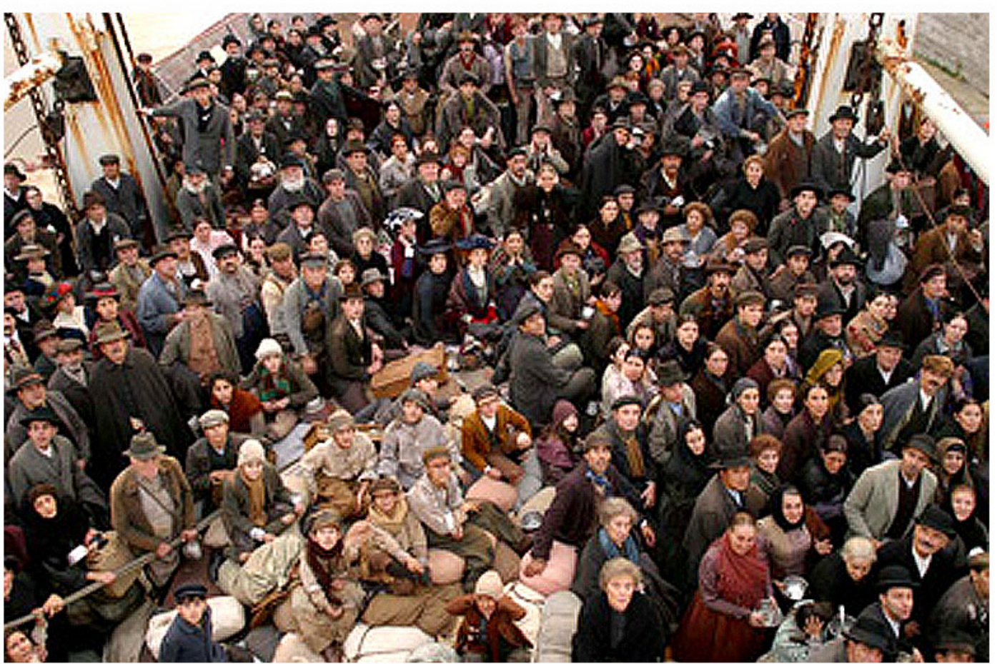
Color images from the film "The Golden Door"

"Installation of a State inspector and a Department of Labor official at Ellis Island, the one to supervise passports, the other to act as an immediate court of appeals from decisions of boards of inquiry. Cooperation between immigration officials abroad and American consuls to select the proper kind of immigrants and to ban at the start all who are obviously disqualified to enter the United States."