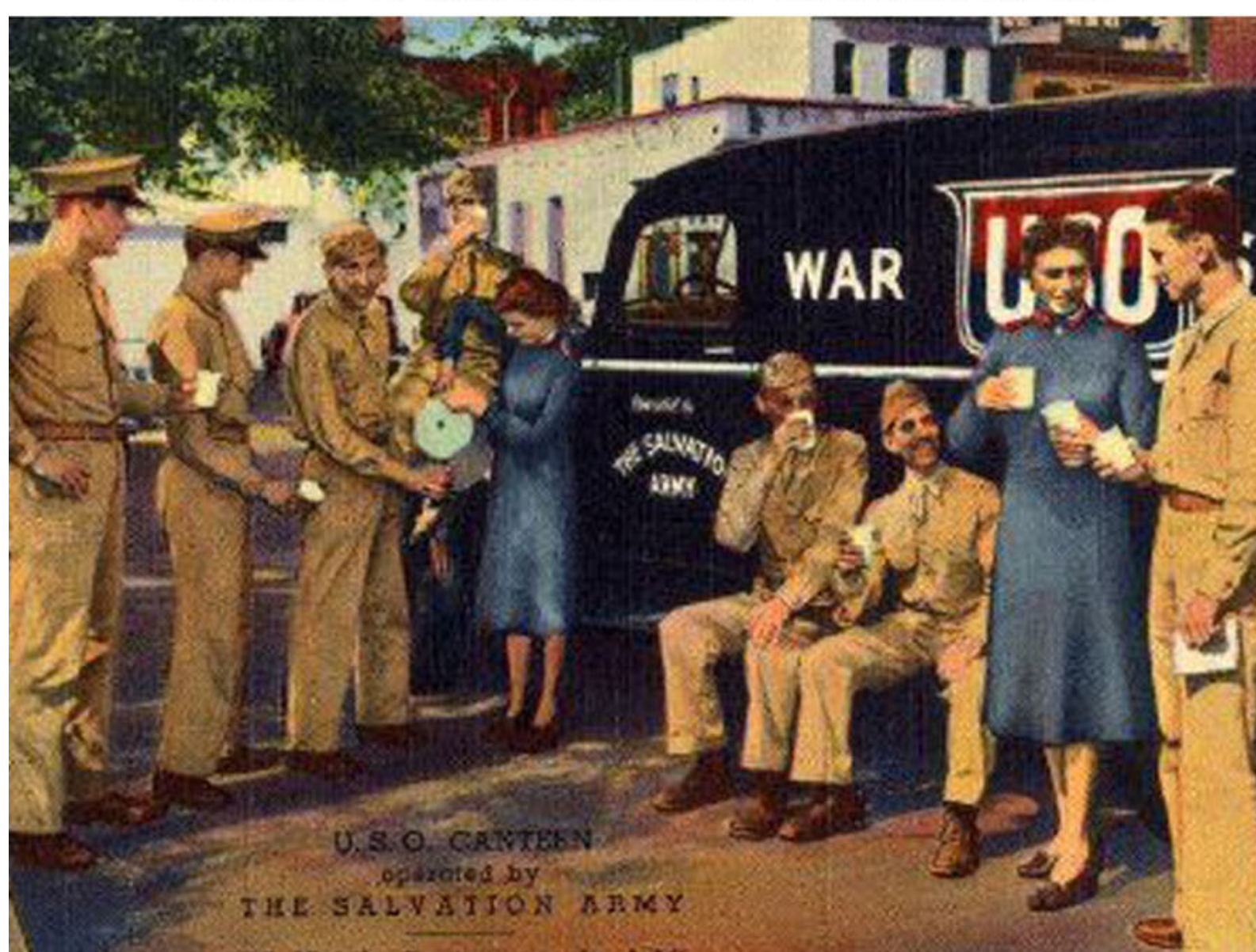
U.S.O. CANTEREN operated by THE SALVATION ARMY