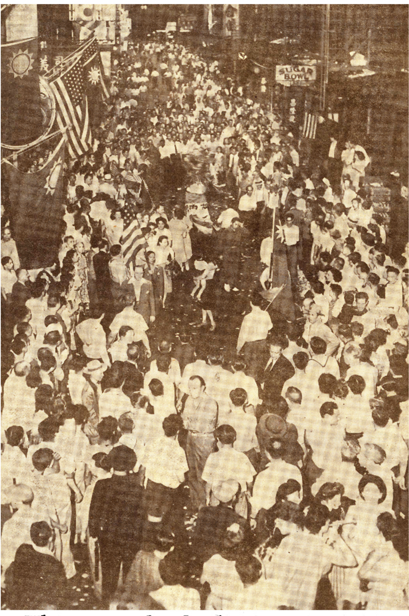
This was Elizabeth St. at Mott St. when Chinatown's real victory celebration began. Dragon is in center of crowd.