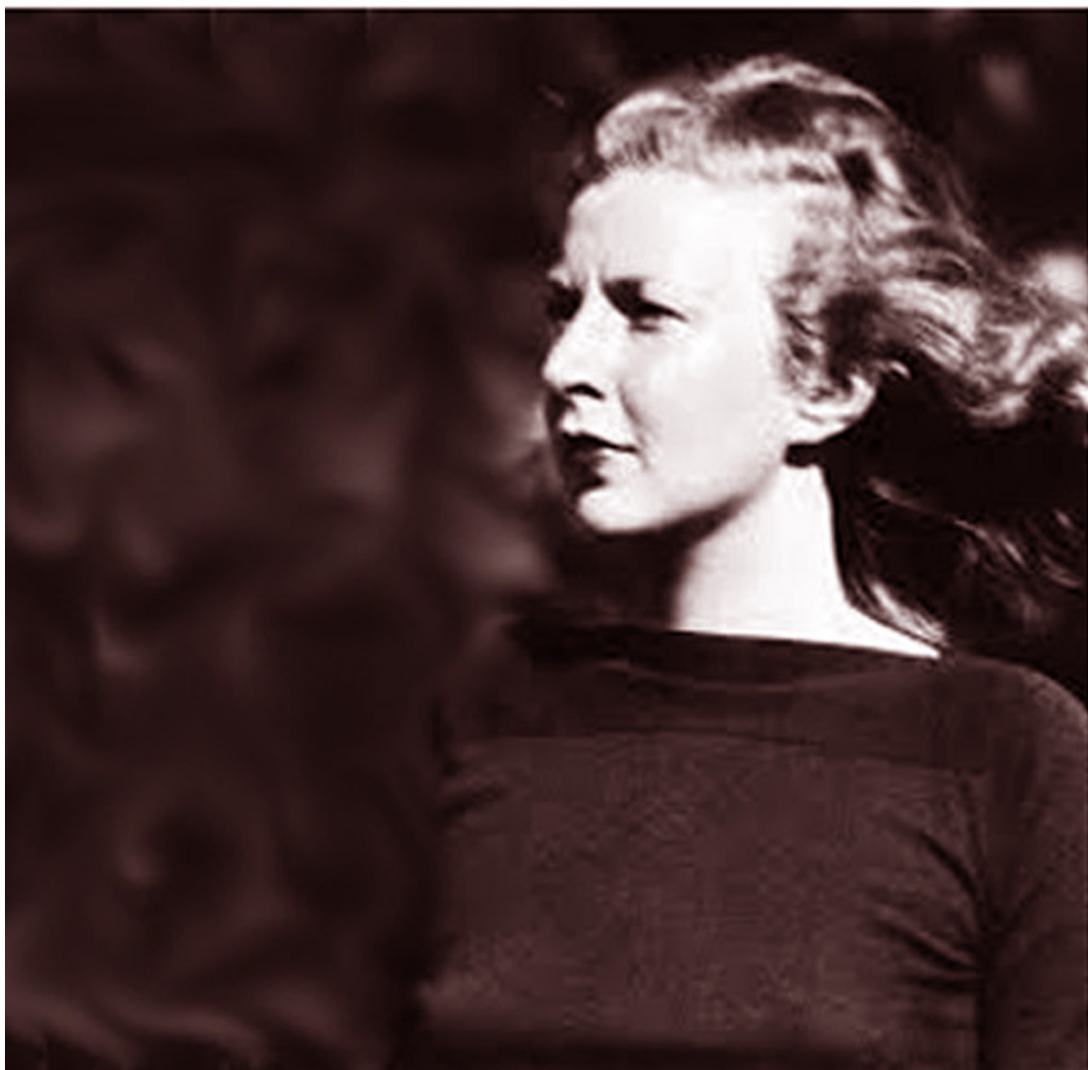
Martha Gellhorn, War Correspondent (image added)

And if ever again we tolerate such cruelty we have no right to peace.