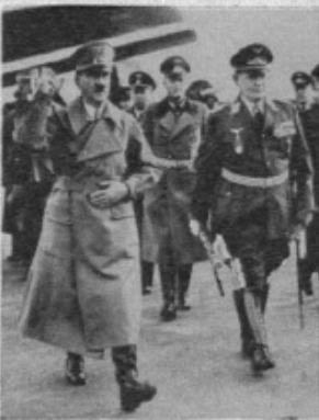
When this picture was taken, Adolf Hitler and Hermann Goering were on their way from the Munich airdrome to attend the ceremonial state funeral of the Nazis killed when a bomb went off during the Nazi old-timers' celebration last year. Hitler, who barely escaped with his life then, fled to Berlin, returned two days later for the state

The Nazi Army, organized to fight on the "Fuehrer Principle," has already shown signs of being demoralized at the top as well as the bottom by the twin deaths of