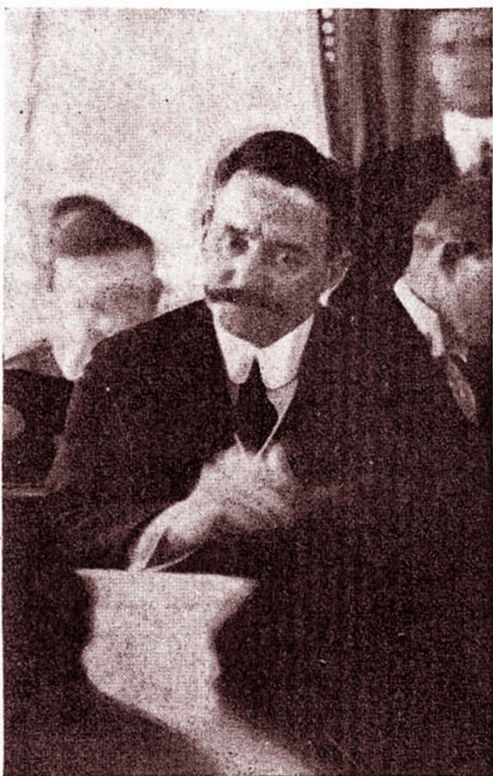
MR. JOSEPH BRUCE ISMAY,

President of the International Mercantile Marine Company, testifying before the committee of investigation. He declares the wreck of the Titanic has taught him a lesson.