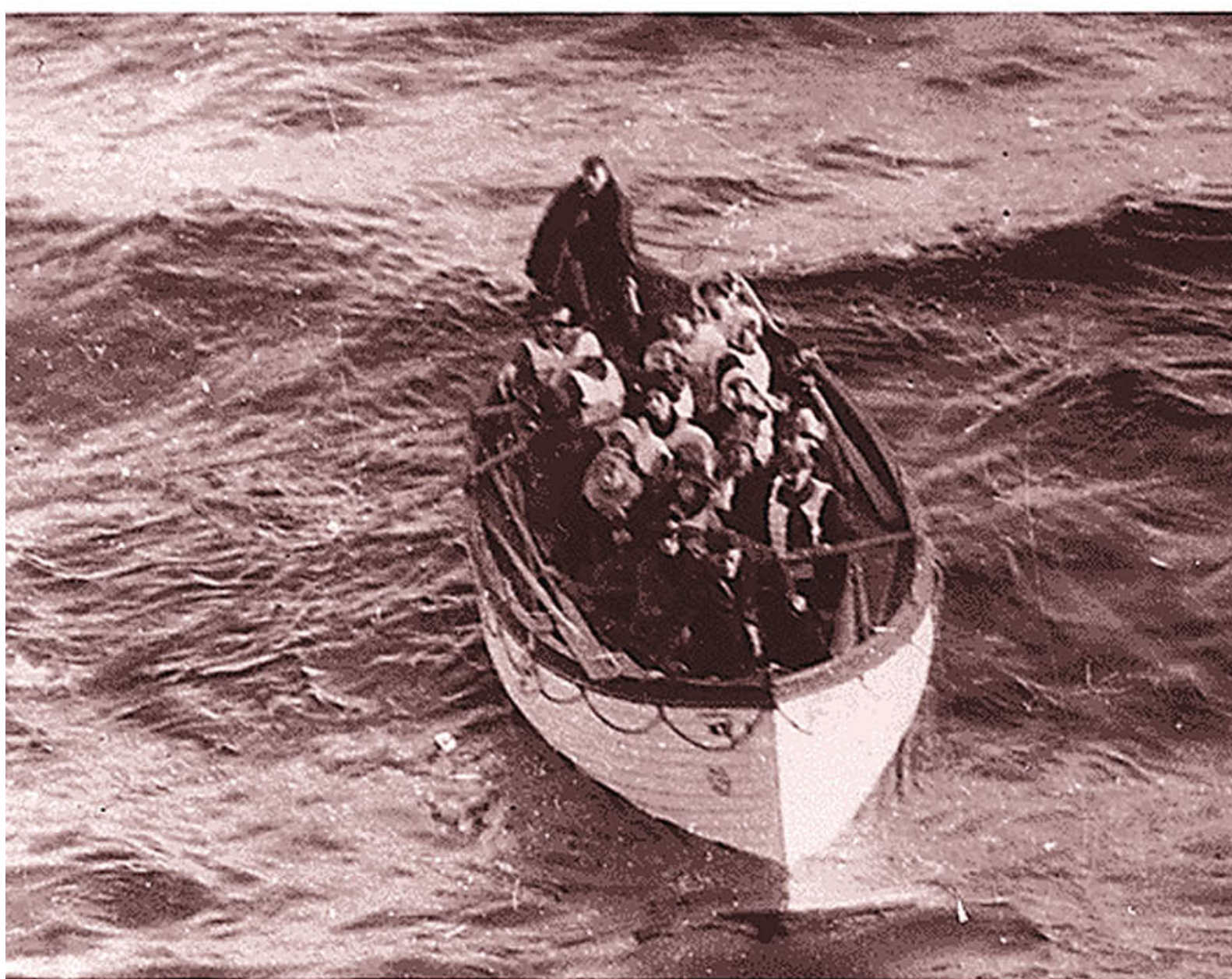
ONE OF THE "TITANIC'S" LIFE-BOATS APPROACHING THE "CARPATHIA," BARELY HALF FULL.

"The Titanic inquest is being held here because, as one of the members of Parliament suggested yesterday, many American citizens lost their lives in the disaster. . . . Nor can there be any valid denial of the right of this Government to investigate the equipment and conduct of foreign ships which seek the use of its ports and the patronage of its citizens, and in so doing to ask questions of any of the alien owners and officers of those ships whom it may happen to find within its jurisdiction."