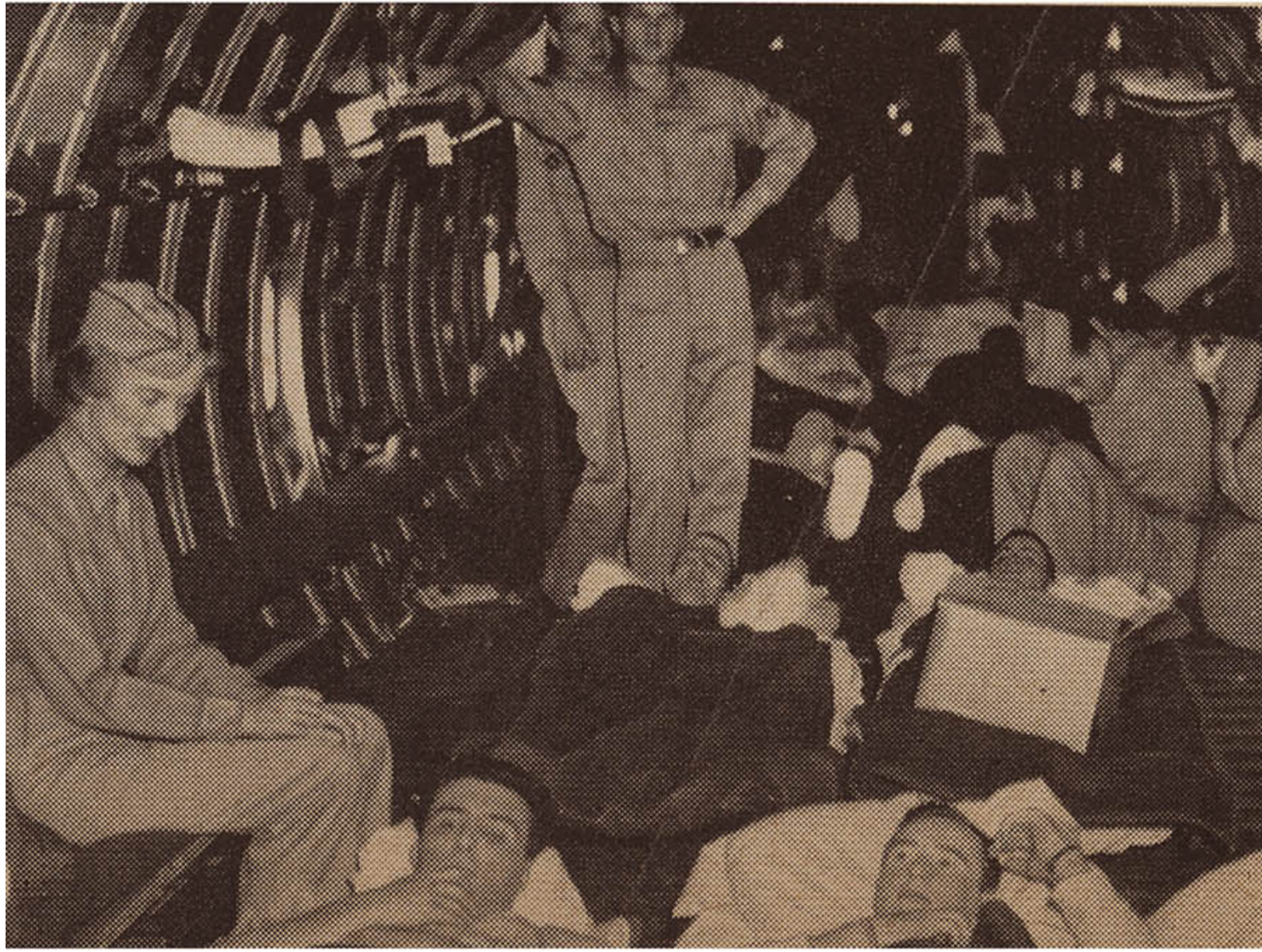
ARMY NURSE TENDS WOUNDED FROM KOREA IN U. S.-BOUND PLANE