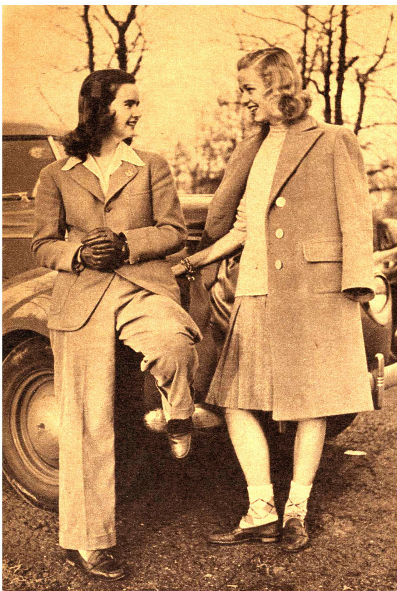
High school girls find moccasins the best footwear for motoring in the country, slacks best for getting in and out of rumble seats.