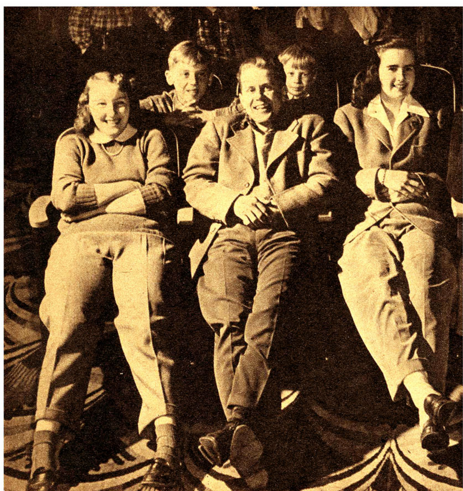
AS THEY DO IN HOLLYWOOD, ENGLEWOOD GIRLS WEAR SLACKS AT NIGHT, HERE RELAX HAPPILY AT THE NEARBY TEANECK THEATRE