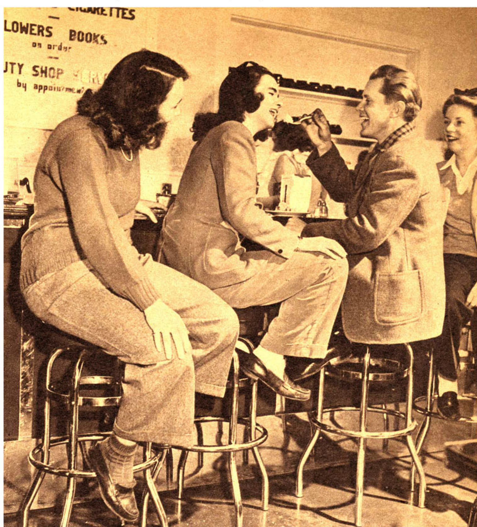
Favorite afternoon hangout for these Englewood girls is the swank Hospitality Shop where there's no regulation against slacks. If there were, they'd AS THEY DO IN HOLLYWOOD, ENGLEWOOD GIRLS WEAR SLACKS AT NIGHT, HERE RELAX HAPPILY AT THE NEARBY TEANECK THEATRE