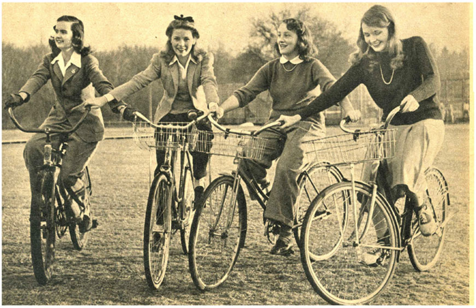
MORE SIGNIFICANT THAN THE FACT THAT SLACKS SAVE SILK IS ONE SOCIAL SCIENTIST'S STATEMENT THAT GIRLS CAN'T HAVE ECONOMIC AND POLITICAL FREEDOM WITHOUT FREEDOM IN DRESS