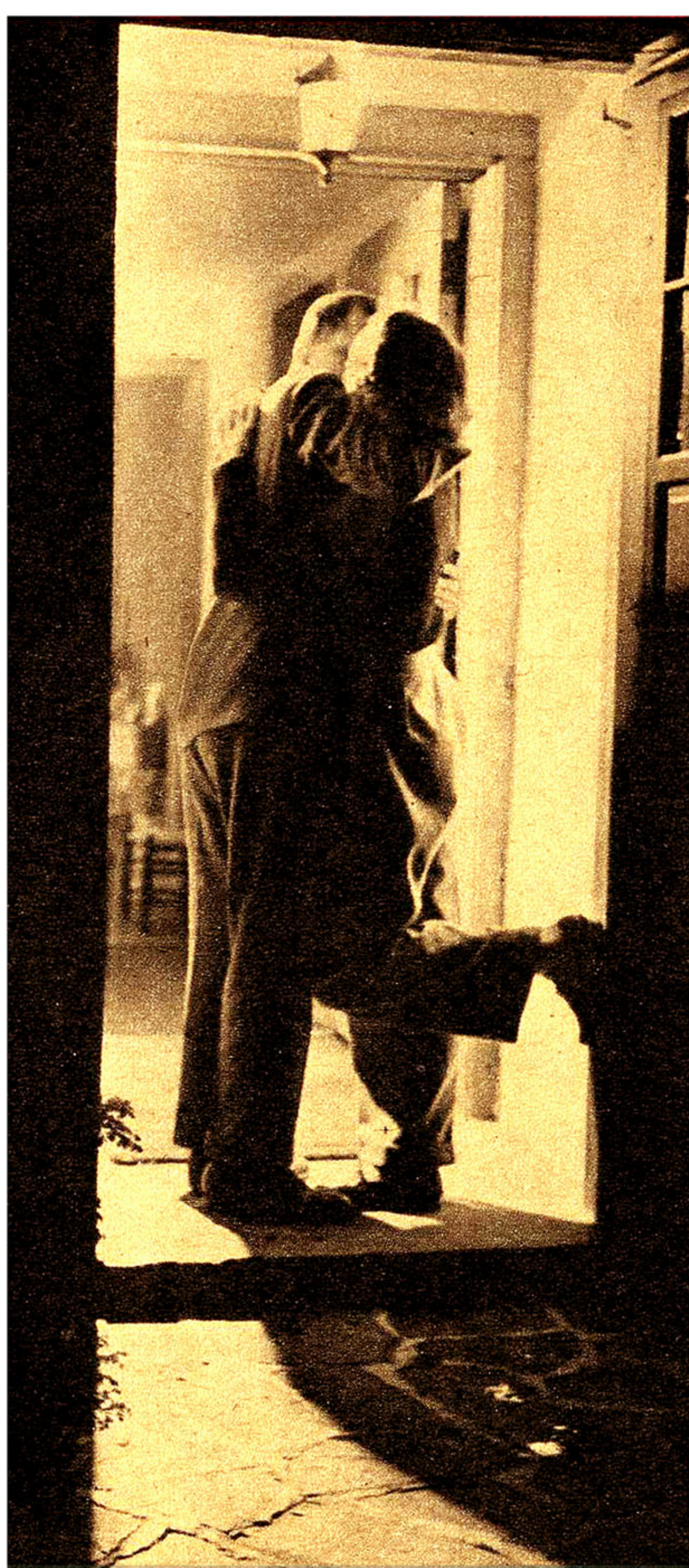
AND AFTER THE MOVIES A FOND GOOD NIGHT