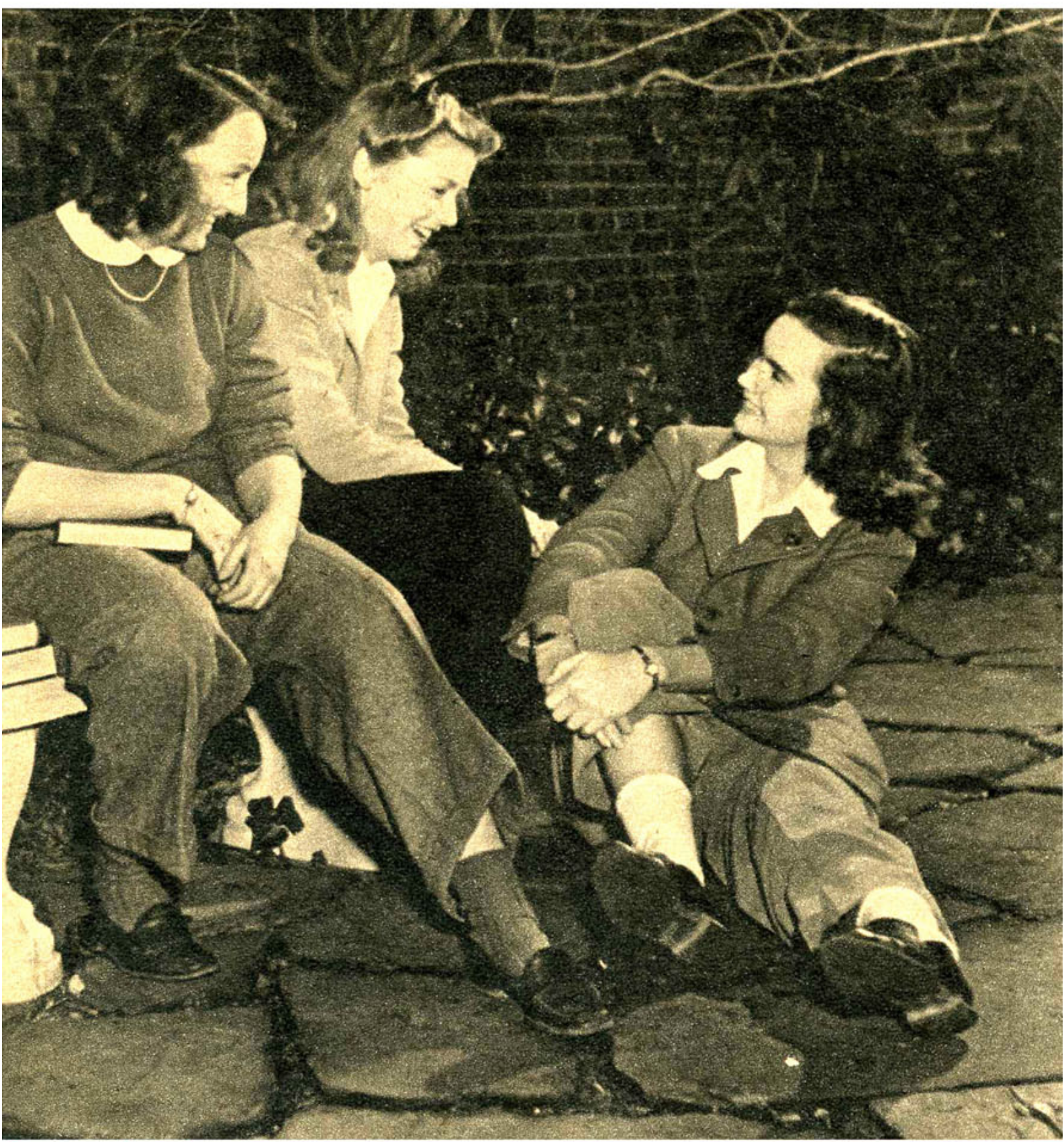
Parental and male objections notwithstanding, slacks are demonstrably appropriate for such strictly feminine pastimes as gossip fests in the yard during recess.